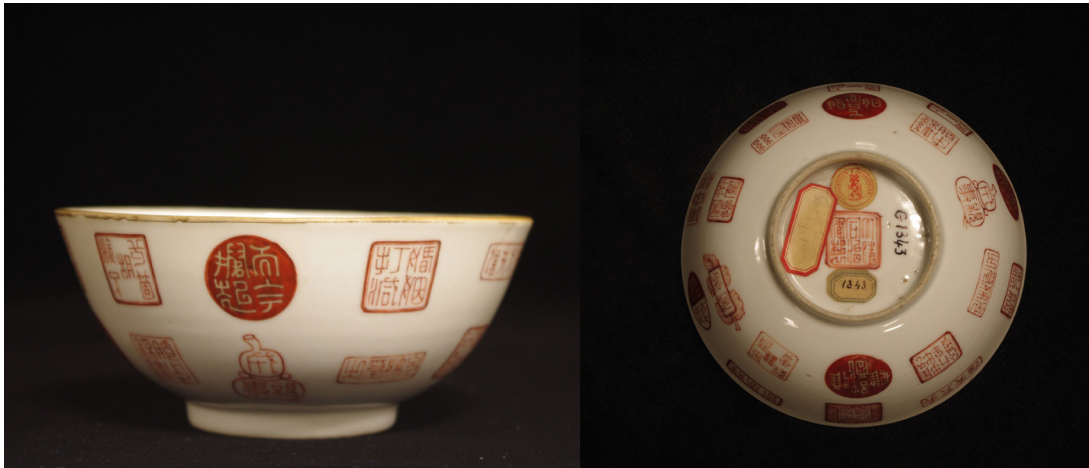
Fig. 7: Bowl, China, kilns of Jingdezhen (Jiangxi), Qing dynasty, Tongzhi period (1861-1875), porcelain, 6 x 13,5 cm, mark “Da Qing Tongzhi nian zhi”