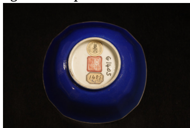
Fig. 8: Bowl, China, kilns of Jingdezhen (Jiangxi). Qing dynasty, Tongzhi period (1861-1875), 6,5 x 12,5 cm, mark “Tongzhi nian zhi”. Paris, musée des Arts asiatiques - Guimet, inv. G1405

number of such cases raises questions about the role of dealers as intermediaries, in the light of the previous considerations about their relationship with the collector. Mer-