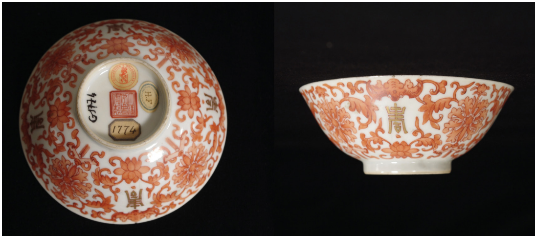
Fig. 4: Bowl, China, kilns of Jingdezhen (Jiangxi) Qing dynasty, Xianfeng period (1851-1861), porcelain, 5,5 x 12,6 cm, mark “Da Qing Xianfeng nian zhi” Paris, musée des Arts asiatiques – Guimet, inv. G1774