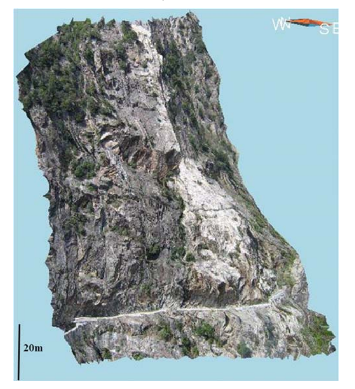
Figure 1 : 3D view of les Rochers de Valabres site AFTER Clement (2007)

et al. 2009; Dünner et al. 2007; Gunzburger et al. 2011, Merrien-Soukatchoff et al. 2007; Merrien-Soukatchoff et al. 2010).