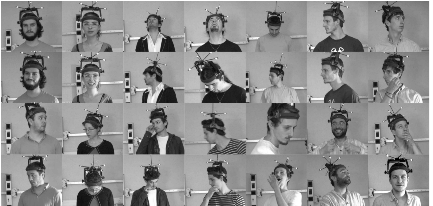
Fig. 2. Example frames from the ISIR-Eikeo Database.