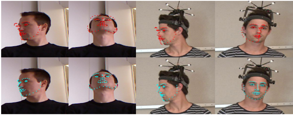
Fig. 4. Examples of head pose tracking on Biwi and ISIR-Eikeo datasets. Top row CLM, bottom row PA-CLM.

between the points of the 3D model and the corresponding landmarks in the image. Second, we propose a Pose-Adaptive Appearance Model, (PA-AM) that combines decision of multiple classifiers depending on the head pose estimate. Evaluations were performed on two datasets and we see that our approach improves the accuracy of the head pose tracker. Moreover, we present a new challenging head pose database with a precise ground truth which exhibits a wide variation of poses, occlusions and illumination changes