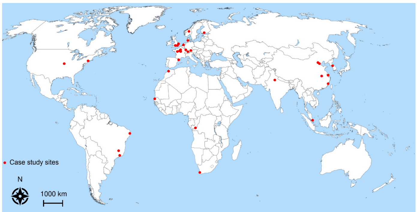
Figure 1. Cases supporting the definition of Human–River Encounter Sites.

The conceptual basis of HRES is founded on six main tenets: health, safety, functionality, accessibility, collaboration, and awareness (Figure 2). These tenets should be seen as a preliminary set and should stimulate discussion at the levels of scientific research and practical implementation. For each tenet, we provide a description below in terms of its central importance in the context of HRES, an integrative review of its conceptual underpinnings in the natural and social sciences, selected applied examples, and recommendations for its implementation in attempt to establish HRES.