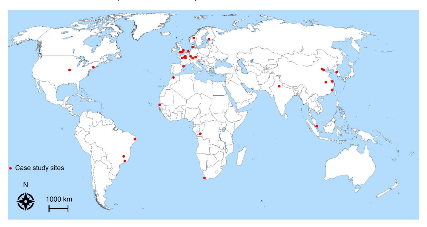
Figure 1. Cases supporting the definition of Human–River Encounter Sites.

The conceptual basis of HRES is founded on six main tenets: health, safety, functionality, accessibility, collaboration, and awareness (Figure 2). These tenets should be seen as a preliminary set and should stimulate discussion at the levels of scientific research and practical implementation. For each tenet, we provide a description below in terms of its central importance in the context of HRES, an integrative review of its conceptual underpinnings in the natural and social sciences, selected applied examples, and recommendations for its implementation in attempt to establish HRES.