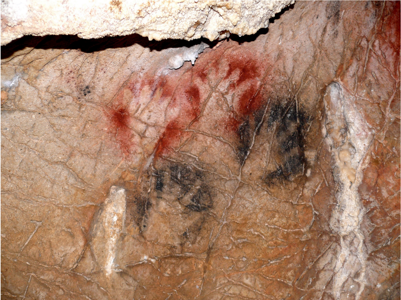
Fig. 1: Stencils in Gargas

Notable numbers of hand stencils with missing fingers can be specially observed in the French sites of Gargas (Foucher et al. , 2007), Cosquer (Clottes et al. , 2005), Tibiran (Clot, 1984), and the Spanish Maltravieso (Collado, 2013) and Fuente del Trucho (Ripoll et al. , 2001; Utrilla & Bea, 2015). Isolated mutilated hands also appear occasionally, as in the Grand Grotte of Arcy-sur-Cure (Baffier & Girard, 1998), in Margot (Pigeaud et al. , 2006), in Altamira (Freeman & Echegaray, 2001), in Chauvet (Clottes, 2010), or in Erberua (Larribau, 2013) among many others (Groenen, 2016).