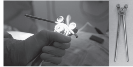
FIGURE 1: classic French bender use to shape rods.

For patients diagnosed with AIS, 15 levels were fused on average and a pedicle subtraction osteotomy (PSO) was done in 4 cases (17%). This subgroup of patients were aligned preoperatively and remained aligned postoperatively (postoperative SVA = 27 mm, PI-LL = 5°, and PT = 20°). Four