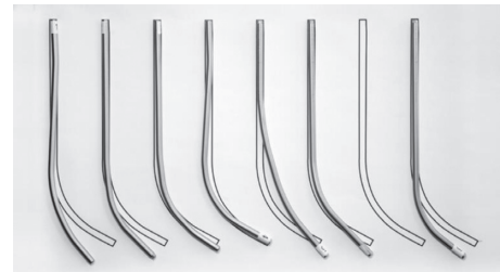
FIGURE 2: Example of rod bending by 7 surgeons showing the difficulty of reproducibility.

patients had a preoperative hypokyphosis ( <20^\circ ) and were corrected postoperatively.