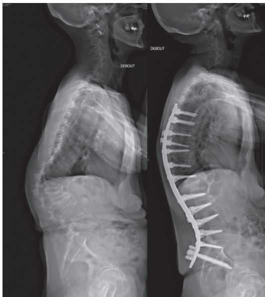
FIGURE 5: Example of sagittal realignment procedure using PSR in a patient with fixed thoracolumbar junction kyphosis (a). Surgical planning included a T6-ileum fixation with a L1 osteotomy and 3-month postoperative result (b).

With regards to AIS patients, a recent study by Solla et al. [11] reported the results of 37 patients managed using PSR. Their strategy involved an over bending of the rod in the concavity of the deformity which led to a correction of thoracic kyphosis for hypokyphotic patients underlining the interest of PSR in the management of AIS.