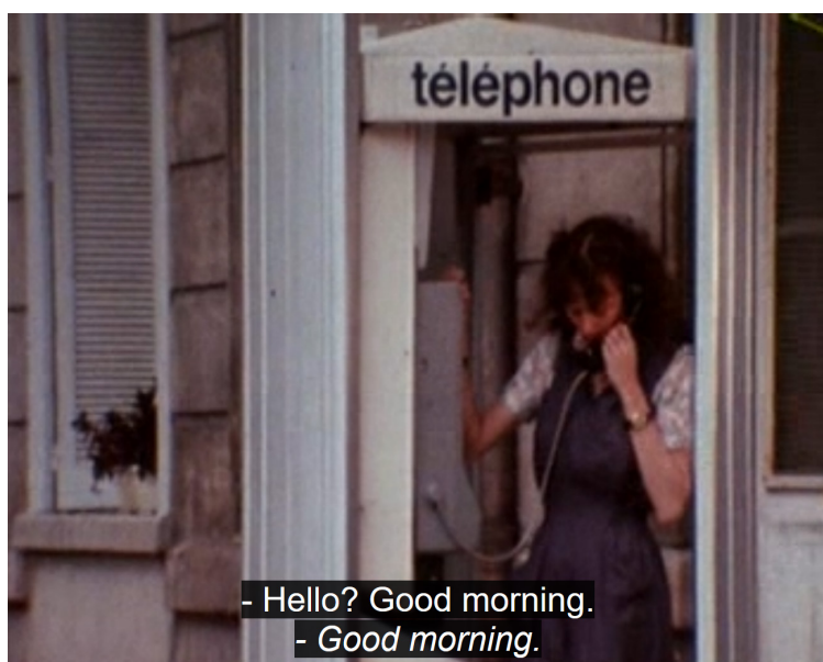
Video 4. Questions de solidarité (RTS, Micheline Paintault, 1982).