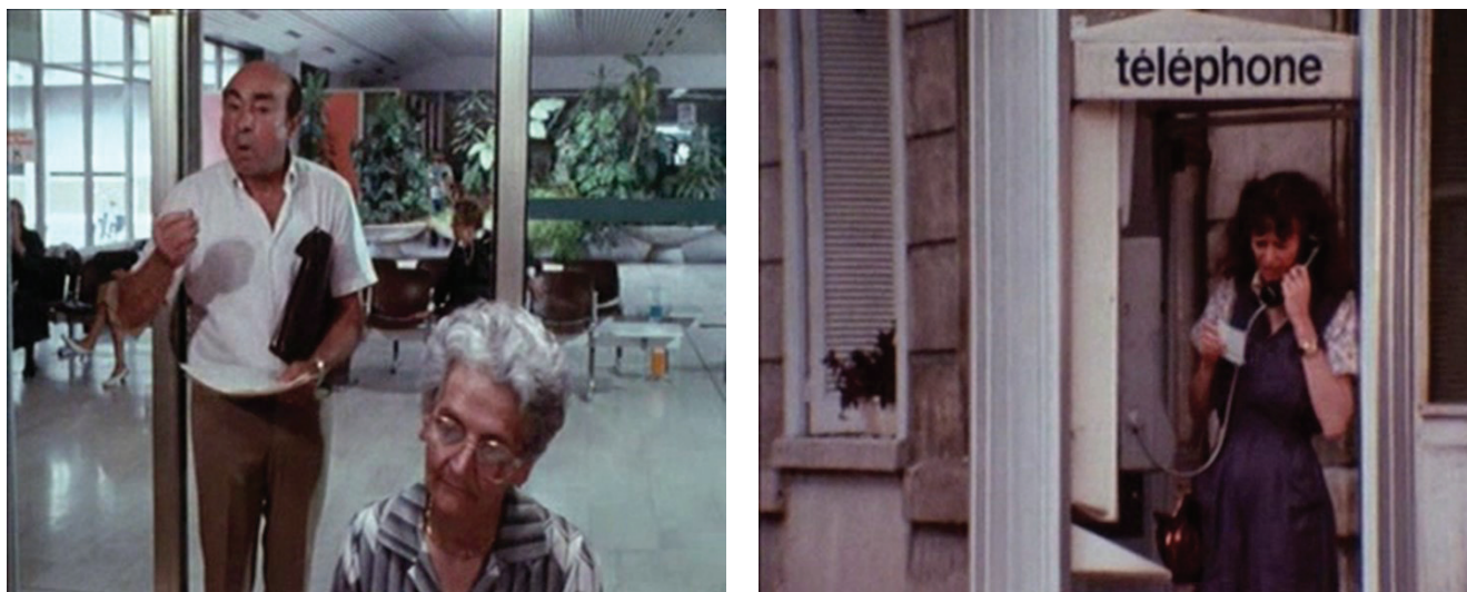
Figure 7 (a, b). Complainant user at the reception desk and difficult reception over the telephone in Questions de solidarité , 1982.

As mentioned above, in Questions de solidarité , a man comes in to the social security office and complains to an official. He protests strongly against the decision made by the administration to withdraw money from his mother’s account. 51 What is the purpose of this scene? Undoubtedly it illustrates the misunderstandings and concerns that the system gave rise to among users, as well as problems that social security officials had to deal with on a daily basis. The same film opens with a scene where a young woman calls social security offices from a phone booth. The scene is tense and the shot is a close-up composition with the glass walls and roof of the booth framing the young woman.