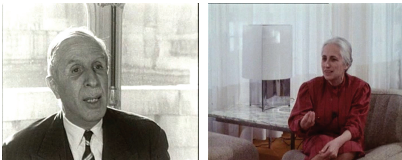
Figure 3 (a, b). Interviews with ministers of health legitimizing social achievements in La sécurité sociale , 1969 (3a) and Questions de solidarité , 1982 (3b).

All three films feature interviews with political figures. As representatives of the state they set out to explain the civic principles on which national health insurance is based. The 1969 version of La sécurité sociale features Pierre Laroque, the President of the National Social Security Fund from 1953 to 1967. Questions de solidarité (1982) includes two interviews with Nicole Questiaux, the Minister of National Solidarity between 1981 and 1982. In order to legitimize the social security system, they both refer to a time when it did not exist: a past era, in which families from the less well-off classes confronted with unexpected health problems did not know how to cope with them financially. Both films stress the importance of solidarity as a mechanism structuring social relationships in society and as a condition for enhancing a nation's economic development and prosperity.