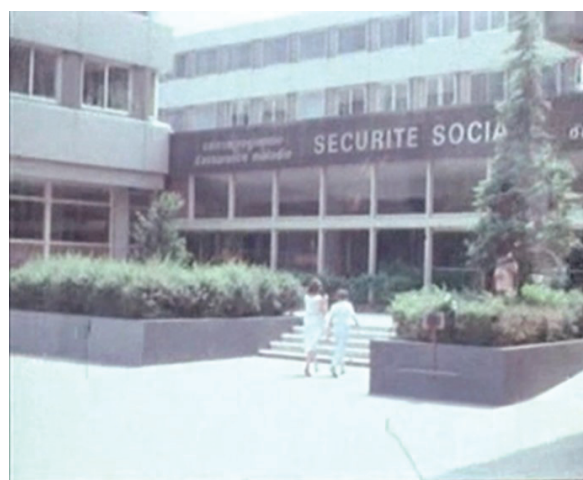
Figure 4 (a, b). Scenes of users entering social security offices in Sécurité sociale , 1957 (4a) and in Questions de solidarité , 1982 (4b).

Similarly, in Questions de solidarité , the second film sequence begins inside public transport. In the foreground, an elderly woman sits by the window. Through the bus window, the camera follows the building façades, stopping at one with the inscription “ Sécurité sociale – Caisse primaire d’assurance maladie ” on the front of the building, suggesting that the sequence is following the woman's thoughts. The bus stops in front of a bus shelter marked “ Arrêt Sécurité ”