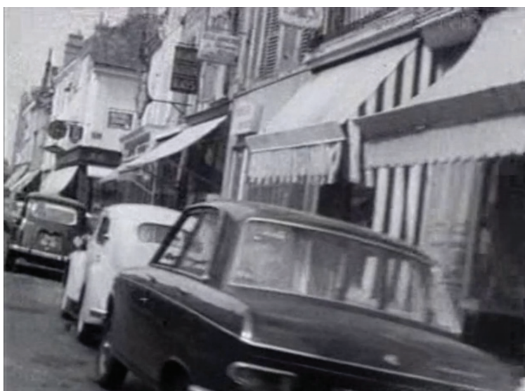
Video 1. La journée d'un médecin (RTS, Madeleine Hartmann, 1968).

similar accompanying material has not been archived for the films studied here, but these educational recommendations expressed similar concern with familiarizing students with the administrative procedures necessary for routine healthcare.