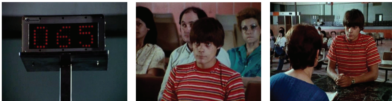
Figure 6 (a, b, c). Reception desk innovation and scenes of encounters between social security officials and users in Questions de solidarité , 1982.

In La sécurité sociale (1969), the interview given by Pierre Laroque is shown alongside an office scene in which an elderly man tries to find out how to be reimbursed for his recent hospitalization (Image 5). After the official's explanations, the man puts his papers away, adding: "Now I have something else to ask you..." 42 The sequence ends there without the conversation going any further. Even though it is limited, La sécurité sociale (1969), like the other two films, immerses students in the atmosphere of health insurance offices. It enables them to witness conversations between users and officials and familiarizes them with the workings of the institution, with requests for information being made on one side of the reception desks and service counters and instructions to follow being given on the other.