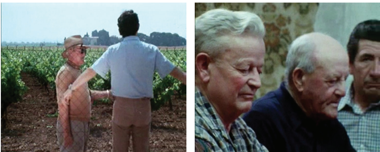
Figure 9 (a, b). User portrayed in the rural working environment in Questions de solidarité , 1982.

While Sécurité sociale (1957) connects welfare and health, twenty-five years later, Questions de solidarité places more emphasis on working conditions. It is more centred on the social category of small business owners, self-employed workers and farmers. It has several sequences on small employers in the winegrowing and clothing sectors. While inspecting a vineyard, a young winegrower calls out to a worker. “Why are you alone?” The worker replies that his colleague had a pain in his stomach. The employer shrugs and laments “Well, he’s going to have surgery, it’s going to be two months off work, once again!” 58 Questions de solidarité also addresses other types of societal issues specific to rural areas, such as tensions between generations and the rural exodus by the younger generation. A manager of the farmers’ mutual health insurance fund ( Mutualité Sociale des Agriculteurs ) explains that “it is normal that the general regime should help our mutual fund, as there are no longer any young people in our countryside”. 59