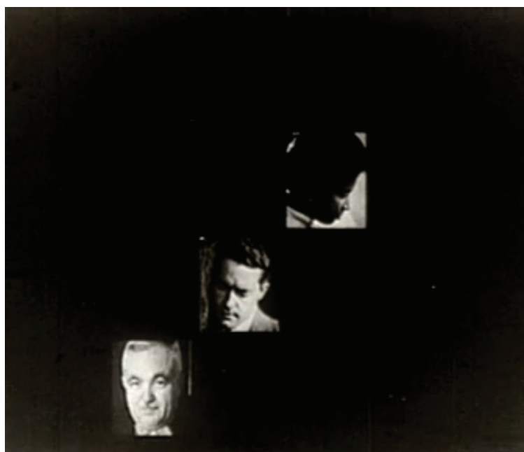
Video 3. La sécurité sociale (RTS, Pierre Buquet, 1969).

sociale , produced by Pierre Buquet in 1969 is part of a series of five films on employment legislation. It adopts a more general approach, explaining the types of risks covered, how to register, who is protected and how coverage is financed. Questions de solidarité (It's all about solidarity) was produced in 1982 by Micheline Paintault. It explains the general functioning of the French social security system and focuses in particular on how people are covered when they have to stop working due to illness, illustrated by actual testimonies in the wine production sector in the Hérault region.