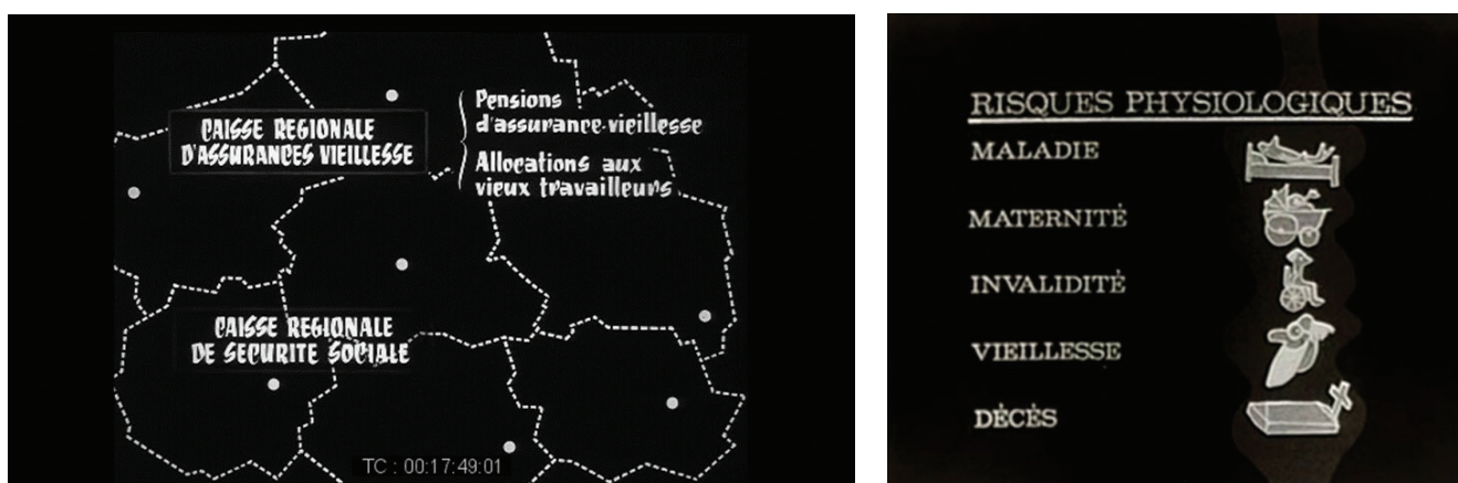
Figure 2 (a, b). Maps and tables providing instructive information in Sécurité sociale , 1957 (2a) and La sécurité sociale , 1969 (2b).

The three programmes reflect the particular importance the RTS attached to combining theoretical instruction with people's real experience with social security. They all include purely informative sequences on national health insurance. The 1957 film Sécurité sociale uses maps to show that all areas of the country are covered by the system. This film, as well as its 1969 counterpart, use animated tables and diagrams to explain types of risks covered and the different health services provided. In Questions de solidarité , an assortment of press articles from the L'Humanité and Le Figaro newspapers from 1945 provide a reminder that the social security system was set up immediately after the Second World War.