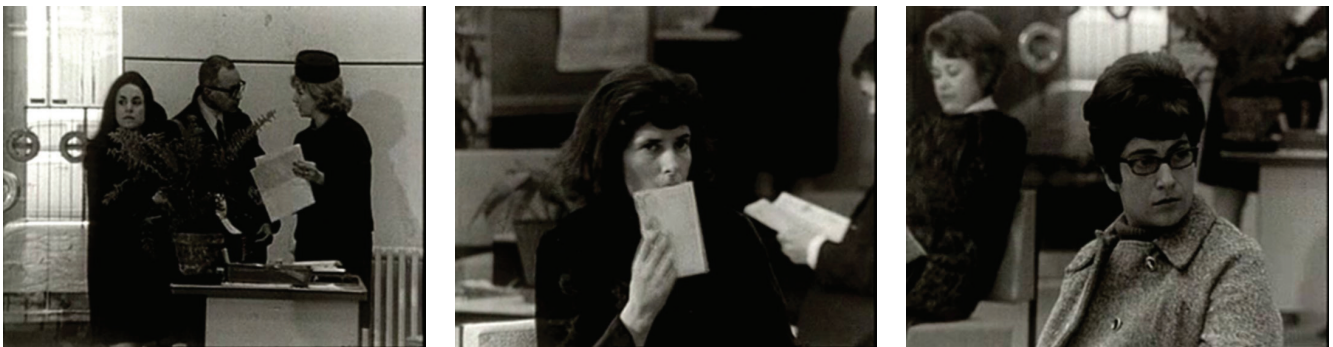
Figure 8 (a, b, c). Worried users portrayed in La sécurité sociale , 1969.

Through a subtle documentary construction, La sécurité sociale (1969) captures the feeling of vulnerability that users are likely to experience in the face of a system upon which they are increasingly dependent. Shots taken in a waiting room capture the tense facial expressions of users awaiting their turn, betraying uncertainty about the outcome of their visit to the office.