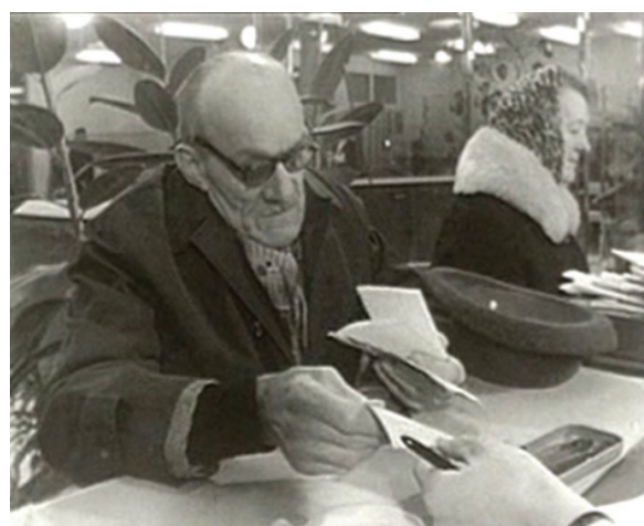
Figure 5 (a, b). Reception desk scenes of encounters between social security officials and users in Sécurité sociale , 1957 (5a) and in La sécurité sociale , 1969 (5b).

The film Questions de solidarité portrays a functional institutional rationalization: the number call system. The sequence at the reception desk begins with a close-up of an electronic display indicating a number, over which we hear the sound of a signal. A young man, whom students can identify with, looks at the number, gets up and walks to the counter. He tells the official that he has been unemployed for a year, but has just had an accident and wants to know if health insurance still covers him. We hear the manager at the counter reassuringly reply that there is no problem as he is indeed still covered by unemployment health insurance. Such meticulously arranged sequences of official encounters at the desk stresses the ordinariness of the institution as well as its users. These day-to-day experiences of the social security office and its standard procedures are fascinating anthropological studies of the institution and are much more than purely theoretical school television programmes. 41