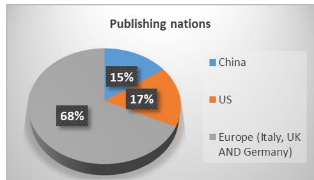
Figure 3: The publishing nations of the case studies related to implications of Industry 4.0 in the circular economy (source of data: Rosa et al.,2020)

Rosa et al., (2020) also provided a synthesis of the literature of circular economy in the context of Industry 4.0. According to these authors, the published case studies are related to China, the US, and Europe. The topics of published papers are more focused on life cycle management, supply chain management, resource efficiency, smart services, and the adoption of the new business models. Hence, more research should be performed in other countries and focusing on topics such as Dismantling 4.0, reusing, and recycling 4.0 as well as remanufacturing 4.0. Figures 3 and 4 highlighted these gaps. In the following sub-sections, the implications of data analytics deployment, virtual reality, and blockchain with perspectives of the application in the case of EoL aircraft treatment are discussed.