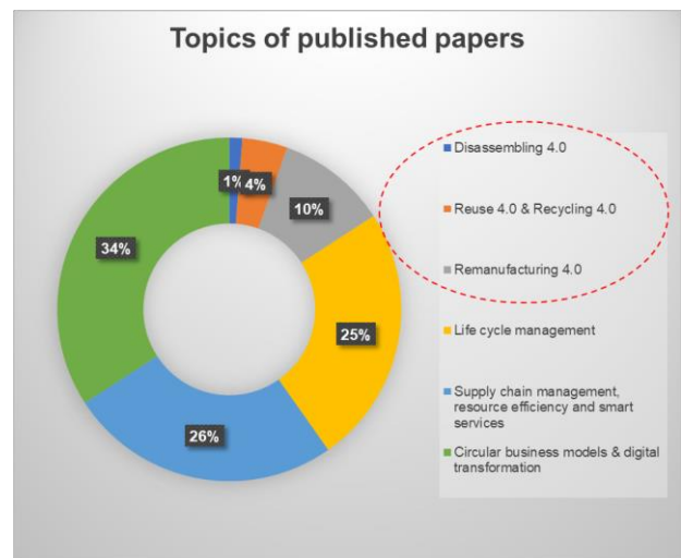
Figure 4: The gaps in the topics of the articles( Disassembling 4.0, Reusing 4.0, recycling 4.0, and remanufacturing 4.0 are the research areas that needed more attention (Source of data: Rosa et al., 2020)