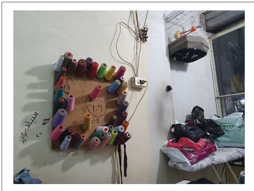
Picture 3. Shatila, 2019. A canary in the store of a Syrian tailor.