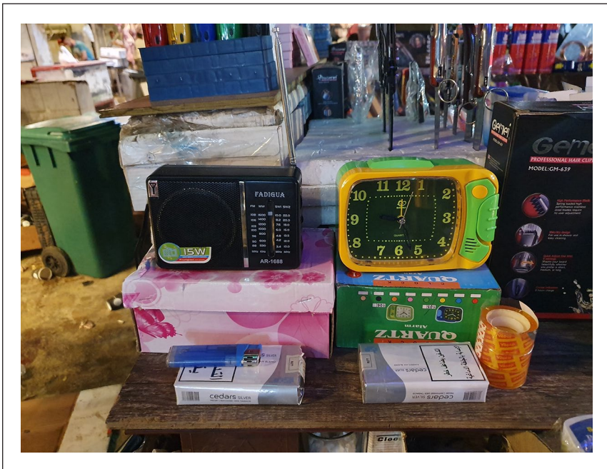
Picture 4. Sabra, 2019. A stand selling small domestic devices.

The pre-exilic objects presented at the beginning of this text, the electric fan and the radio, continue to be a part of the daily lives of the inhabitants of the camp. Of course, some offices and authorities have the benefit of air-conditioning, and the use of transistor radios has diminished to be replaced, initially by television and, nowadays, by computer screens and smartphones. Nevertheless, these two sound objects of the material culture are still present in every house of Palestinians as well as Syrians, and of Asian and African migrants (Picture 4). The fact that such banal objects have been chosen to be included among the witnesses of life before 1948 demonstrates the great importance given to those times, since the faintest trace of them has such an evocative power, the power to conjure the presence of historic Palestine.