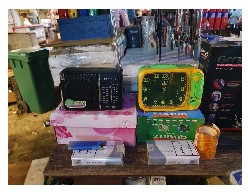
Picture 4. Sabra, 2019. A stand selling small domestic devices.

The pre-exilic objects presented at the beginning of this text, the electric fan and the radio, continue to be a part of the daily lives of the inhabitants of the camp. Of course, some offices and authorities have the benefit of air-conditioning, and the use of transistor radios has diminished to be replaced, initially by television and, nowadays, by computer screens and smartphones. Nevertheless, these two sound objects of the material culture are still present in every house of Palestinians as well as Syrians, and of Asian and African migrants (Picture 4). The fact that such banal objects have been chosen to be included among the witnesses of life before 1948 demonstrates the great importance given to those times, since the faintest trace of them has such an evocative power, the power to conjure the presence of historic Palestine.