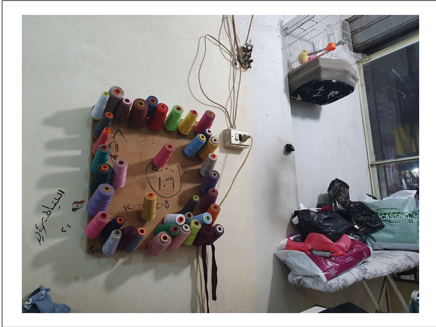
Picture 3. Shatila, 2019. A canary in the store of a Syrian tailor.