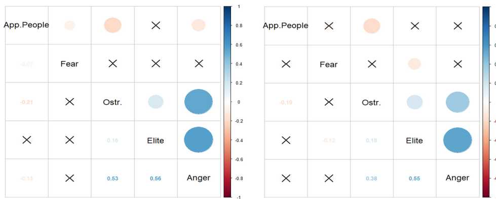
Figure 1. Corrplot (Pearson correlation) among items included in the analysis for each tweet in the first and second corpus. The blue color was used for positive correlation, whereas red for negative correlation. The “X” symbol indicates a non-significant correlation ( p -value greater than 0.05). As can be seen, both graphs show a very similar pattern