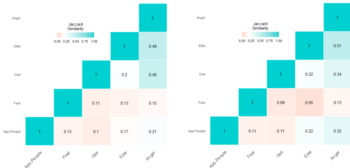
Figure 2. Heatmap of Jaccard similarity among items included in the analysis for each tweet in the first and second corpus. The blue color was used for high Jaccard similarity, whereas red for low Jaccard similarity. As can be seen, both heatmaps show a very similar pattern; this result is consistent with Pearson correlation computed in Fig.1.

It is worthy to note that both on the politicians’ side as well as on the official political parties’ side, the correlation among items is almost superimposable. It is a strong clue that, no matter what the source is, when the context accounts for the political arena it is likely that the political communication on Twitter has some general and somehow recurrent patterns for what concerns these relationships in terms of correlation among variables.