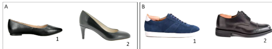
Figure 1. Models of shoes used for the experiment with the elodi model (A1) and the laria model (A2) from the Parallel brand and the barmera model (B1) and the mayfair model (B2) from the Bexley brand.