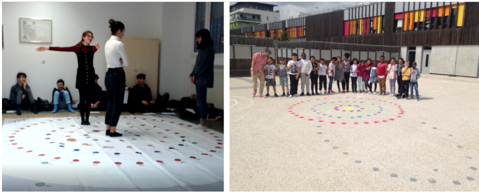
FIG. 3. Modeling activities on the Solar System. Students enact the movements of planets and comets around the Sun on a 2D representation of the orbits, a so called Human Orrery. Left: Students enact and observe movements as seen from different referential frames. Right: Primary school children in front of the Human Orrery they have build in their courtyard.

A “human Orrery” (Fig. 3) allows the learners to enact the planets’ movement with correct relative speed. An Orrery is a mechanical or digital device designed to model the motion of the planets around the Sun and their changing positions in the sky. On a human Orrery, the orbits of planets and comets are drawn at a human scale allowing movements in the Solar System to be enacted by the learners [5, 7]. We give here one example of how this tool may be used to help students learn practice modelisation [9].