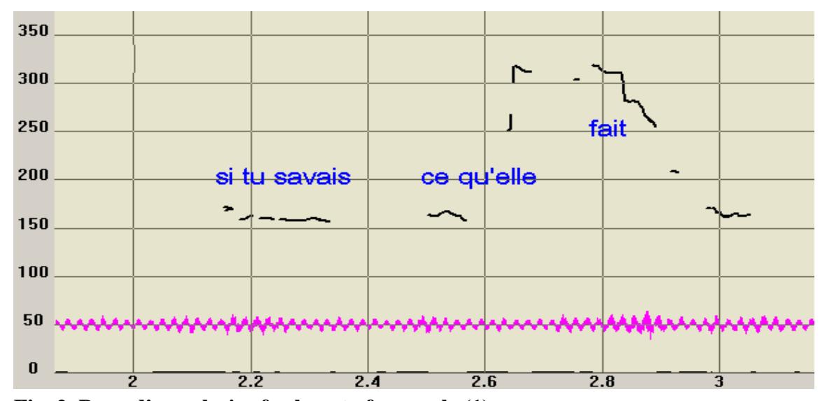
Fig. 2. Prosodic analysis of subpart of example (1)

'well they do stuff // if you knew what she does / she does a lot of internships / she uh is assistant director'