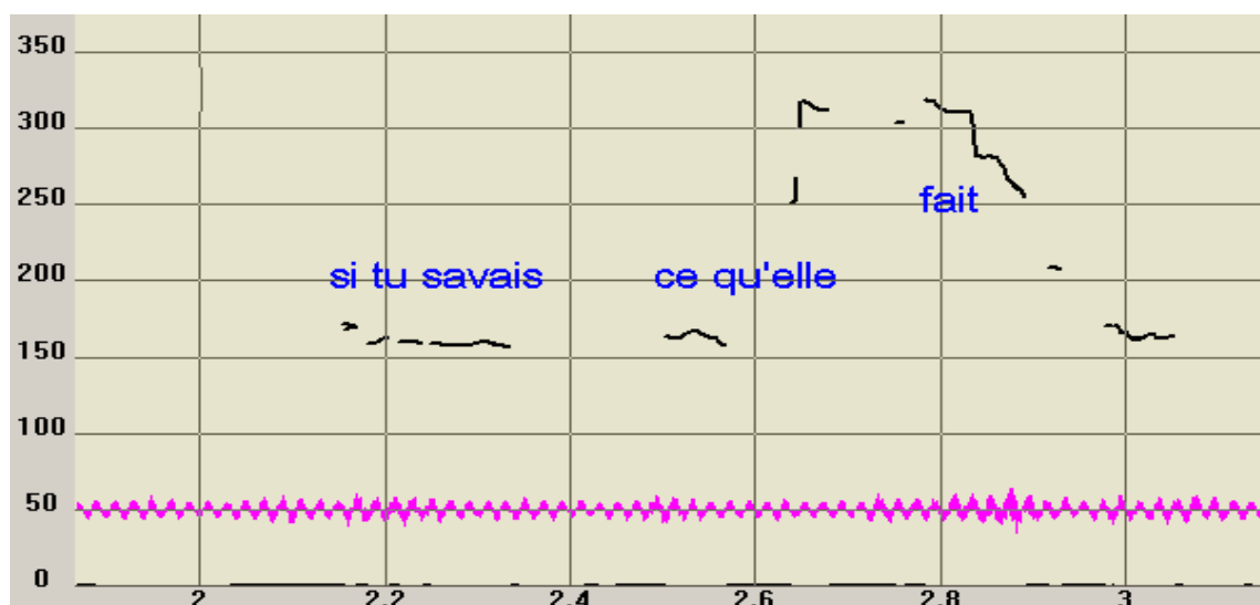
Fig. 2. Prosodic analysis of subpart of example (1)

'well they do stuff // if you knew what she does / she does a lot of internships / she uh is assistant director'