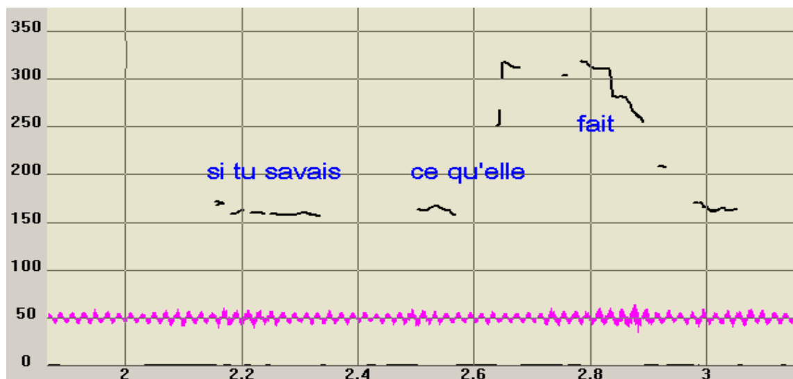
Fig. 2. Prosodic analysis of subpart of example (1)

'well they do stuff // if you knew what she does / she does a lot of internships / she uh is assistant director'