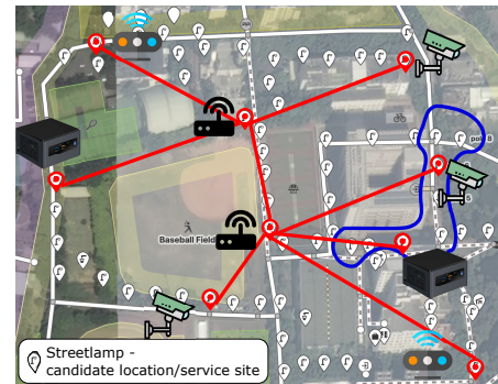
Figure 2: Sample result at NTHU with streetlamps as inputs.

Fig. 2 shows a sample result at NTHU, where 3 cameras, 2 motion sensors, 2 WiFi APs, and 2 edge servers are deployed. Then the deployed devices form a planning graph, where red circles and lines represent devices and the connectivity between devices.