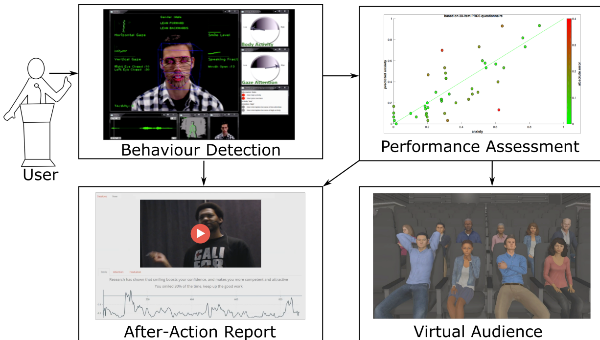
Fig. 1 General architecture of our public speaking training system.