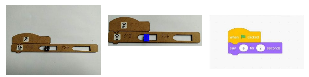
Figure 3: From a simple algorithm to the algorithm in Scratch after the visual recognition.

By adding TopCodes symbols and associated libraries, each block's type is optically recognized by the software part using a web-cam; while the values inside blocks are recognized by cubarithms ' analysis: the TopCodes' analysis identify the types of blocks used in the algorithm; while the cubarithms ' analysis identify the values held into such blocks. A JSON file and related resources are then generated as a SB3 file (common extension for Scratch language) to be read by Scratch (as shown in Figure 3).