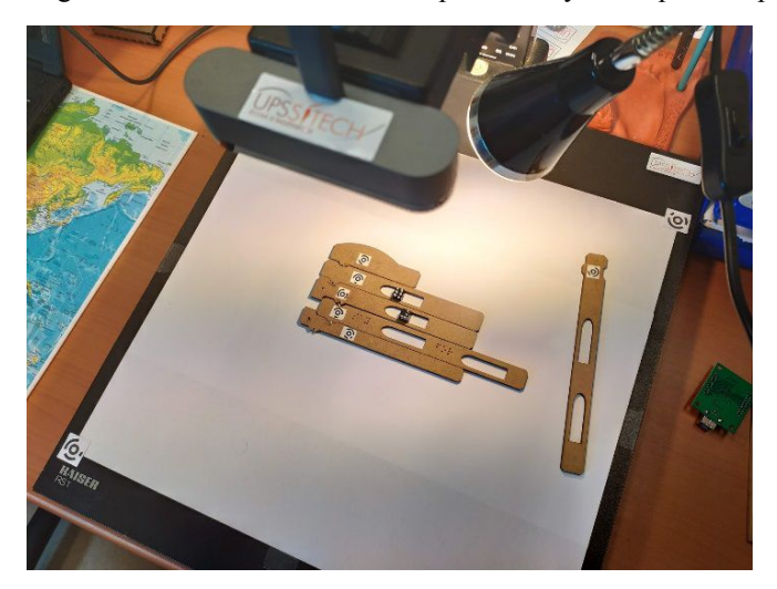
Figure 2: Full platform overview.

While the precedent features were highlighted because they favour recognition by the user, the second part of the TabGo prototype centers around optical recognition of the algorithms (recreated with blocks) by the system. The solution presented here, in addition to blocks, centers around the use of a webcam to automatically recognize the cubarithms and the TopCodes<sup>12</sup> symbols placed upon the blocks.