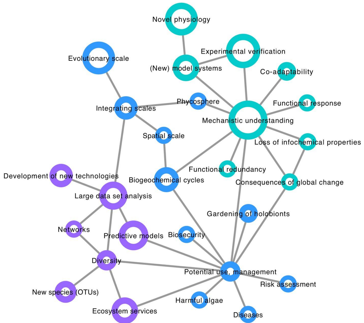
Figure 3: Mind map of key concepts, techniques, and challenges related to marine holobionts. This map was generated during the Holomarine workshop held in Roscoff in 2018 ( https://www.euromarinenetwork.eu/activities/HoloMarine ). The size of the nodes reflects the number of votes each keyword received from the participants of the workshop (total of 120 votes from 30 participants). The two main clusters corresponding to predictive modeling and mechanistic modeling, are displayed in purple and turquoise, respectively. Among the intermediate nodes linking these disciplines (blue) “potential use, management” was the most connected.