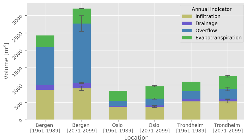
Figure 2. Performance of scenario D1, 1000 m 2 of green roof with combined to a 50 m 2 raingarden; various climate conditions

A comparison of the scenarios depending the location show that it is possible to combine different green infrastructures in Trondheim and Oslo to restore the natural water cycle, while precipitations in Bergen are likely generate significant overflow (Figure 2), even with the natural water cycle. Infrastructure with higher capacity and performance should thus be considered in this location. In all locations, the fraction of infiltrated volume is likely to decrease as rainfall volume increase more than infiltrated volume (scenario C1, 8 to 4% loss of retention). Scenario relying on infiltration were found to be more sensitive to climate change than scenario relying on evapotranspiration. The error led to higher uncertainty in Bergen than in Trondheim.