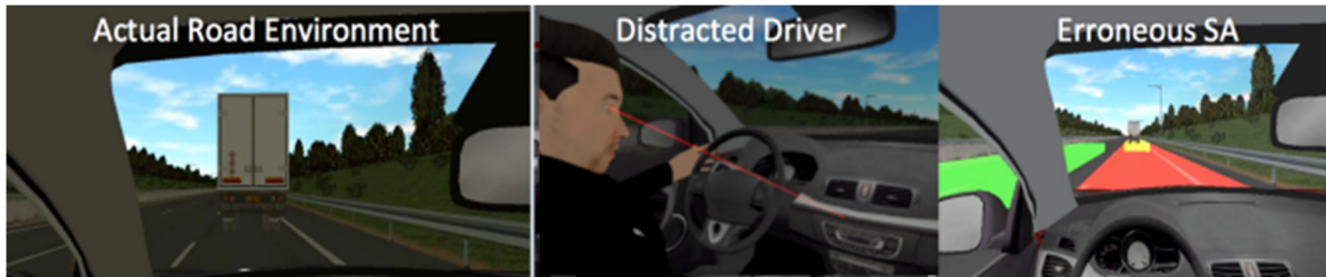
Figure 1: Illustration of the simulation of drivers' visual distraction effects with the V-HCD.