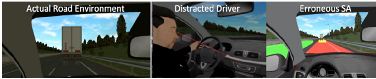
Figure 1: Illustration of the simulation of drivers' visual distraction effects with the V-HCD.