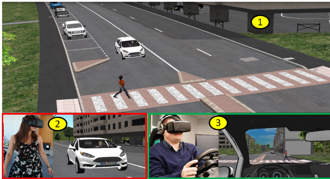
Figure 3: Illustration of an example of scenario implemented on the V-HCD platform to study the interactions between a pedestrian and an AV with a more or less attentive driver.