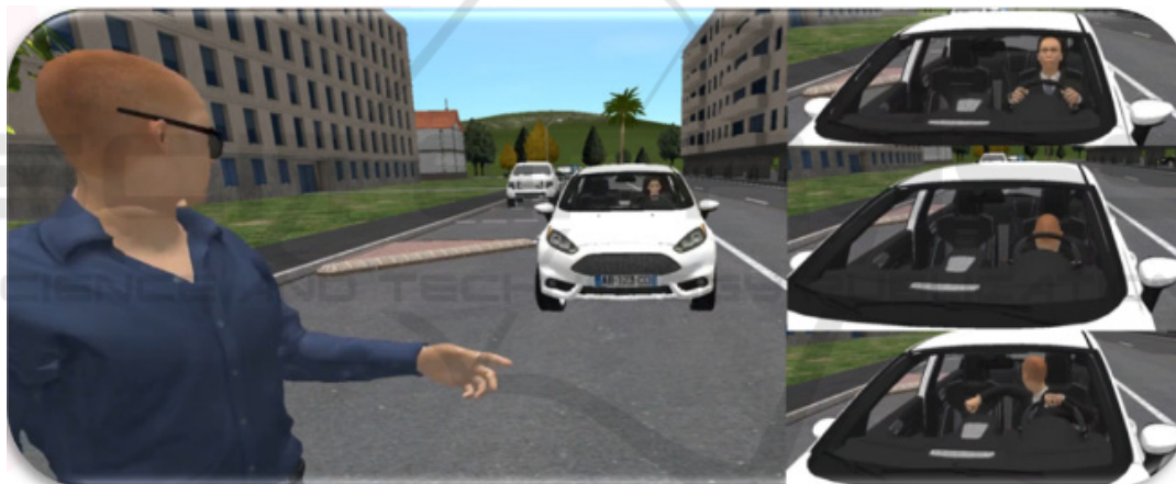
Figure 4: Illustration of examples of driving scenarios implemented on the V-HCD platform to study the interactions between a pedestrian and an AV.

pedestrian by means of the VR headset. Both participants therefore experience the same situation at the same time, but from a different point of view. Each of them can witness the other's behaviour, such as the potential distraction of the AV occupant, or the possible hesitation of the pedestrian before crossing.