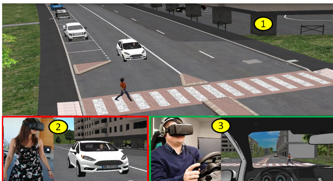
Figure 3: Illustration of an example of scenario implemented on the V-HCD platform to study the interactions between a pedestrian and an AV with a more or less attentive driver.