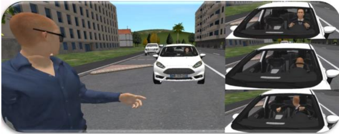
Fig. 4: Illustration of examples of driving scenarios implemented on the V-HCD platform to study the interactions between a pedestrian and an AV.