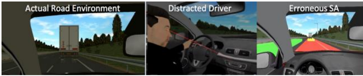
Fig. 1: Illustration of the simulation of drivers' visual distraction effects with the V-HCD.