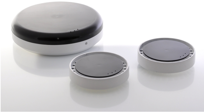
Fig. 1: The LiFiMAX AP and dongles.

In Europe, several organizations started to commercialize LiFi solutions in the 2010s. Among them, Oledcomm was created in 2012 as a spin out of the University Paris-Saclay, after first works on automotive VLC carried out at the Laboratoire d’Ingénierie des Systèmes de Versailles. After developing a VLC and OCC range of products, Oledcomm focused its efforts on the design of LiFi products, which is now its core activity. In 2017, the MyLiFi lamp was launched, which was primarily designed as a remotely controllable light therapy lamp that could also provide a 10 Mbps LiFi network access. Then in 2019, the LiFiMAX solution, shown on Figure 1 and detailed in Section II, was launched for indoor networking usage.