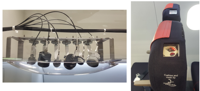
(b) LiFi remote transceiver with fiber optics backbone (left) and EP integrated into the passenger seat (right).