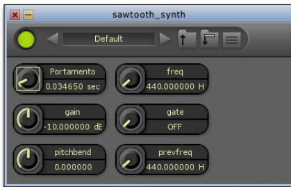
Figure 2: VST plugin generated by FAUST as it appears in MuLab. Using predefined control names “freq”, “gain”, “gate”, “prevfreq” and “pitchbend” automatically maps the controls to MIDI event parameters.

This short loop was produced using only FAUST-generated VSTi plugins, with the exception of the drums.