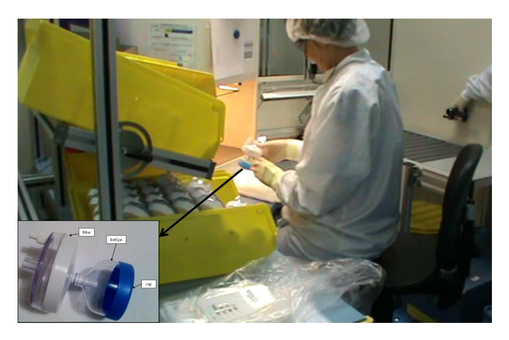
Figure 1: Workstation dedicated to filter cleaning and description of the filter.

The workstation described in this study aims to clean filters dedicated to medical material (see Fig. 1). More precisely, the worker had to clean each subpart of the filter, to put subparts together, to vacuum the filter, and then to check the quality of the vacuuming. Then, each filter was placed inside a packet and sealed using a vacuum sealer.