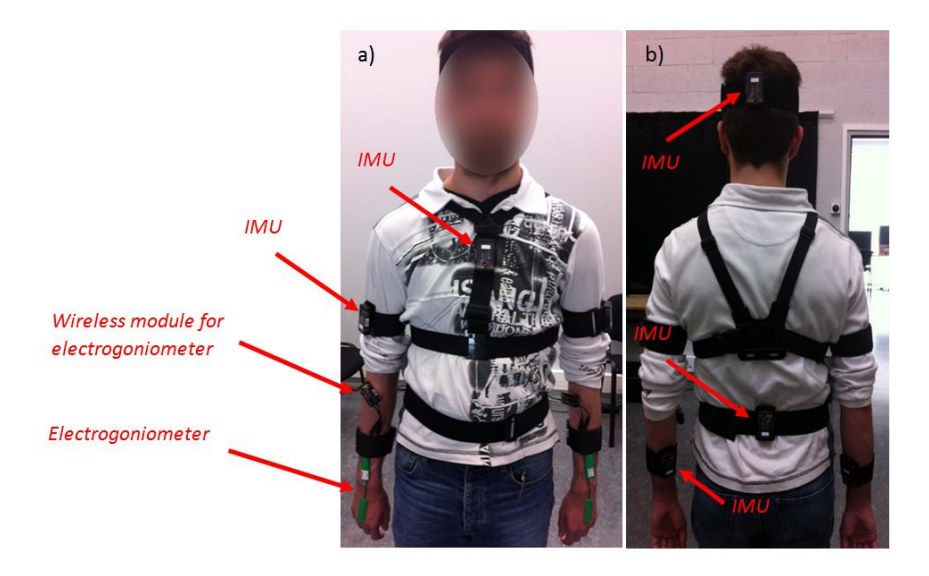
Figure 2: Placement of IMUs, electrogoniometers and their wireless modules in the front (a) and back views (b).

This system was composed of seven wireless CAPTIV Motion IMUs (TEA, Nancy, France). Each lightweight sensor (32 g, 60 \times 35 \times 19 mm) contains a tri-axial accelerometer, a tri-axial gyroscope and a tri-axial magnetic sensor. All sensors were sampled at 64 Hz. The IMUs were placed on the worker's body using manufacturer's guidelines and specific adjustable straps: one IMU for each upper arm, one IMU for each forearm, one IMU for the head, one IMU for the trunk, located on the chest, and one IMU for the pelvis, placed on the sacrum (see Fig. 2). This last IMU was necessary to define the movement of the trunk with respect to the pelvis segment.