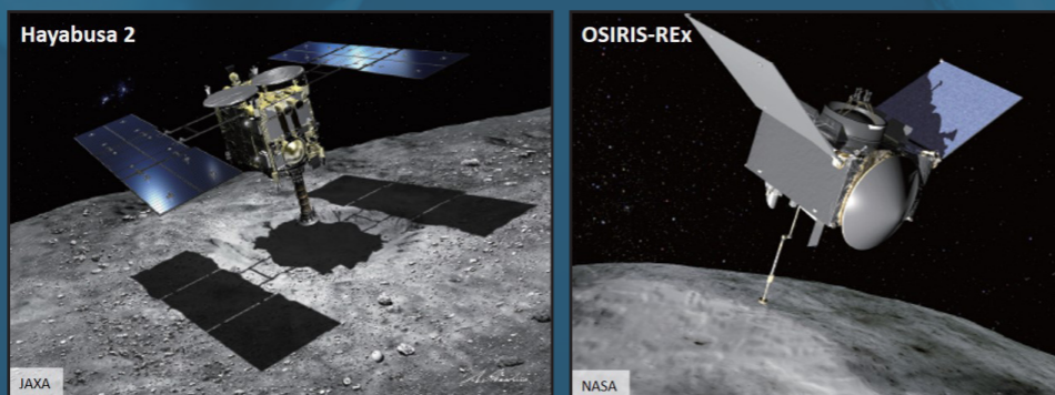
Figure 3: Japan's Hayabusa 2 spacecraft (left) and NASA's OSIRIS-REx probe (right) will bring back precious samples from the near-Earth asteroids Ryugu and Bennu to shed light on the origins of the Solar System and life on Earth.

The significance of the A-LIFE project arises due to the current lack of experimental demonstration that the biomolecular single-handedness of the building blocks of the complex trinity—DNA/RNA, proteins and lipids—can simultaneously and asymmetrically be synthesised by a universal physical selection process. Our aim is, therefore, to develop a synergistic methodology to build a unified theory for the origin of all chiral biopolymers, from rich interstellar ice chemistry as nurseries for the formation of life's chiral monomers, with special emphasis on their stereoselective evolution in cometary and meteoritic matter, to their accumulation and amplification on the early Earth. The successive systems will be experimentally simulated in chemical reactors combining novel circularly polarised laser and synchrotron sources with experiments on how life's building blocks assembled