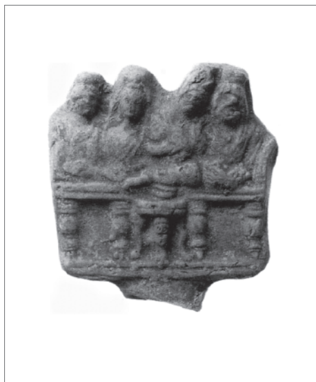
Fig. 8. Hermanubis, Demeter, Isis, Harpokrates and Sarapis on a klinè , ornamental handle, Rome (After Podvin 2011: Hbd-DEbd-lbg-SRbg.m(1), Pl. 62)