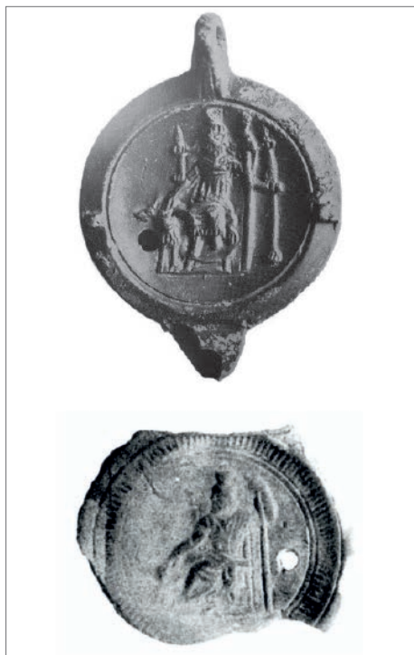
Fig. 1. Sarapis enthroned: top, facing, Rome; bottom, turned leftwards, Marina el-Alamein (After Podvin 2011: Stf.m(5), Pl. 7 [top]; Daszewski 1991: 103, Fig. 5 [bottom])

Sarapis appears very often on the ornamental handles in the collection of the Alexandria Museum, where these ornaments ( delta -shaped or plastic) constitute 62% of the occurrences, against roughly 16% outside Egypt. The collections would have favored handle attachments over decorated discs, hence these numbers may not be reliable, but in general handle attachments constitute a feature particularly appreciated among the potters of Alexandria and its hinterland (Chrzanowski 2015: 33), especially for lamps with a minimum of two nozzles.