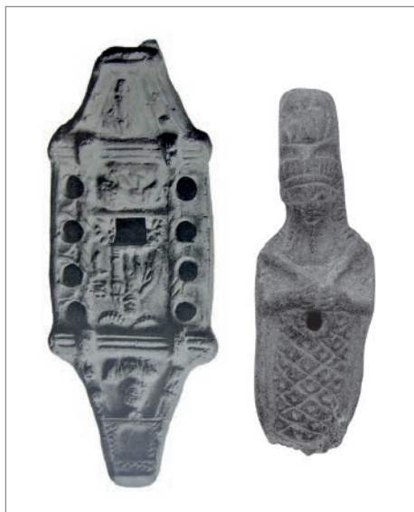
Fig. 9. Plastic lamps: left, boat-shaped lamp, Alexandria(?); right, mummiform lamp, Alexandria (After Weber 1914: 31, No. 12 and Pl. I [left]; Gallo 1998: 154, Fig. 2 [right])