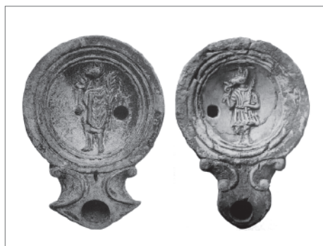
Fig. 3. Anubis: left, wearing a chlamys; right, in a tunic, from Lurs (After Podvin 2011: Adg1.m(1), Pl. 28 [left]; Adg2.m(7), Pl. 29 [right])

The motif of Anubis alone is typically born outside Egypt. It has been demonstrated (Podvin 2011: 66–68) to be closely linked to the representation of the triad Harpocrates, Isis and Anubis, en vogue in Italy (Rome and Campania) during the 1st century AD. Representations of Anubis alone, first attested in Italy, enjoyed considerable success, spreading to southern Gaul, the Iberian Peninsula, North Africa, and even Brittany, which may look a priori as a surprise considering that this god was not particularly known to non-Egyptian populations.