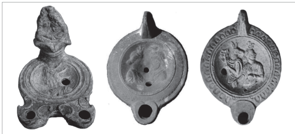
Fig. 6. Isis and Sarapis: left, kissing on an ornamental handle, Sarapis radiatus on the discus, Ostia; center, Sarapis radiatus looking at Isis, North Africa; right, Isis and Anubis looking back, Carthage (After Podvin 2011: Ibd-Sbg.ap(1), Pl. 42 [left]; Ibd-SRbg.m.Bb(55), Pl. 49 [center]; Abd-Ibd.m(3), Pl. 54 [right])

handles, one of which had the particularity of still being attached to a lamp (2004: 83–85): they depict Isis nursing Harpokrates, in one case enthroned, in the other as a bust set in a basket of acanthus leaves (see another example in Zych, Obłuski, and Wicenciak 2008: 93–94), the latter still attached to its lamp. Here again, in the case of Alexandria, ornamental handles form the bulk of the collection (69%).