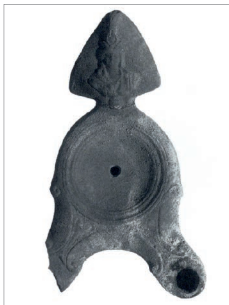
Fig. 2. Isis in bust form on a delta -shaped handle attachment of a two-nozzled lamp, Alexandria (After Georges 2003b: 505)