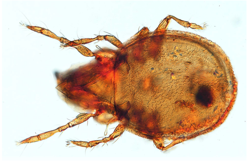
Figure 1 Dorsal view on Xenillus salamoni .

mounting medium. Pictures were taken with a Nikon DS-Ri2 microscope camera and obtained with the aid of Nikon NIS-Elements D software (Nikon Corporation) and rendered with the Helicon Focus 7 program (Kozub et al. 2008).