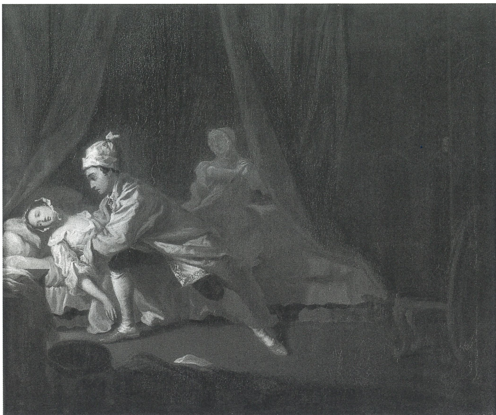
2 Joseph Highmore, Pamela Fainting , oil on canvas, c.1744-45.