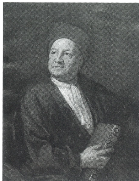
5 Sir Godfrey Kneller, Jacob Tonson , oil on canvas, 1717.