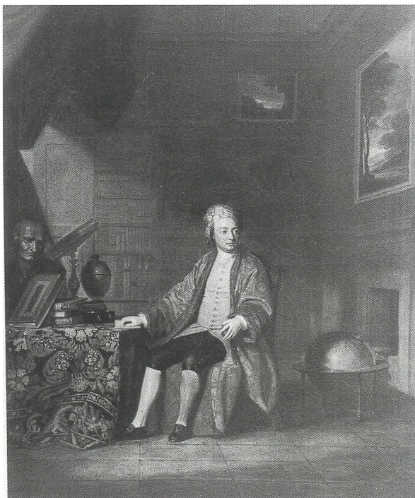
7 George Romney, Reverend William Strickland , oil on canvas, c.1765.

The emergence of a new definition of masculinity was thus accompanied by numerous anxieties, which the ambiguous connotations of nightgowns reflected. The strikingly similar compositions of Romney's portrait of William Strickland (fig. 7) and John Dixon's 1773 caricature (fig. 8) — with their identical spatial arrangements and similar use of lighting and drapery — draw attention to the sharp contrast between the two portrayals of masculinity. Dixon's print shows a man in a fashionable flower-printed cotton gown at his dressing table. The mirror into which he gazes, the picture of Narcissus on the wall, the late hour at which he rises (the clock reads 10 o'clock), the fake books behind him, onto which hair pieces are pinned, and the fool's cap, all point to the man's vanity, vacuity and sexual pretension, turning him into the very antithesis of the 'modern' definition of masculinity. His affected mien and posture, the make-up and perfume on the frilly dressing table, his cotton gown printed in a delicate sprig pattern and his (most certainly French) hairdresser hint at his effeminacy. Whereas Strickland is the embodiment of modern masculinity — manly, sober, learned and English — the old Beau is exactly what men were not sup-