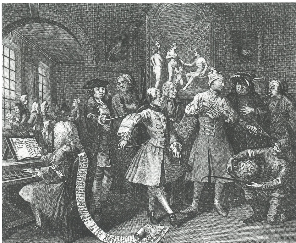
1 William Hogarth, second scene of A Rake's Progress : 'The Levee', engraving, third state, 1735.