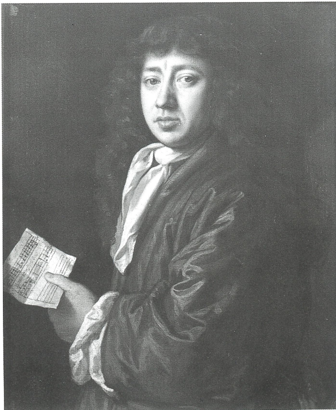
4 John Hayls, Samuel Pepys , oil on canvas, 1666.

In an age when people were increasingly aware of the fickleness of fashion, the timeless appearance of gowns seemed appropriate for portraits: reminiscent of the Roman toga, gowns bestowed the noble dignity so much admired in classical figures. As etiquette dictated that a man should appear in a nightgown only before social inferiors, being portrayed in a nightgown, however plain or common, subtly but force-