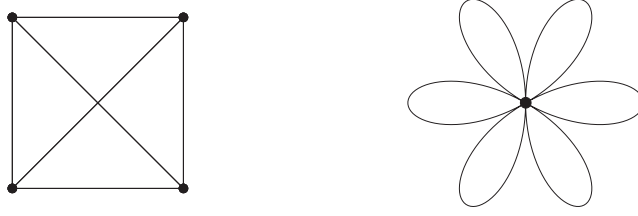
FIGURE 1. Gluing all the vertices of a graph: from a complete graph on four vertices ( left ) to a flower graph on six edges ( right ).

and P_K is the orthogonal projection on K with respect to the Euclidean inner product of \mathbb{C}^{2k} . To see this, we elaborate on the proof of Theorem 3.7 and write I := \{1, 2, \dots, \dim Y^\perp\} . Once fixed a basis \{\mathbb{W}^{(i)}\}_{i \in I} of Y^\perp \subset \mathbb{C}^{2k} , using (3.26) the condition (3.40) is equivalent to