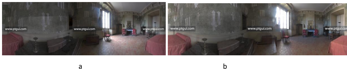
Figure 1: An example of two HDR panoramic image in Margaret of Bavaria's dressing-room taken on a rainy day (a) and on a sunny day (b), both in spring.

However, in this project, the HDR panorama alone does not faithfully render the lighting in the room. The main light source, the original open window of the north wall in figure 1, is under-represented and does not contribute sufficiently to the appearance of the decor. We have therefore added an additional rectangular light source to the scene, representing a virtual version of the window in the room. Unfortunately, Unity engine does not allow the use of non-uniform area light sources. We therefore chose to opt for an approximation based on point sources, positioned on the plane of the source and whose characteristics (colour and position) are defined by importance sampling an HDR image of the window. Figure 2 shows a representation of this sampling with the corresponding image.