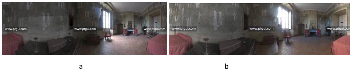
Figure 1: An example of two HDR panoramic image in Margaret of Bavaria's dressing-room taken on a rainy day (a) and on a sunny day (b), both in spring.

However, in this project, the HDR panorama alone does not faithfully render the lighting in the room. The main light source, the original open window of the north wall in figure 1, is under-represented and does not contribute sufficiently to the appearance of the decor. We have therefore added an additional rectangular light source to the scene, representing a virtual version of the window in the room. Unfortunately, Unity engine does not allow the use of non-uniform area light sources. We therefore chose to opt for an approximation based on point sources, positioned on the plane of the source and whose characteristics (colour and position) are defined by importance sampling an HDR image of the window. Figure 2 shows a representation of this sampling with the corresponding image.