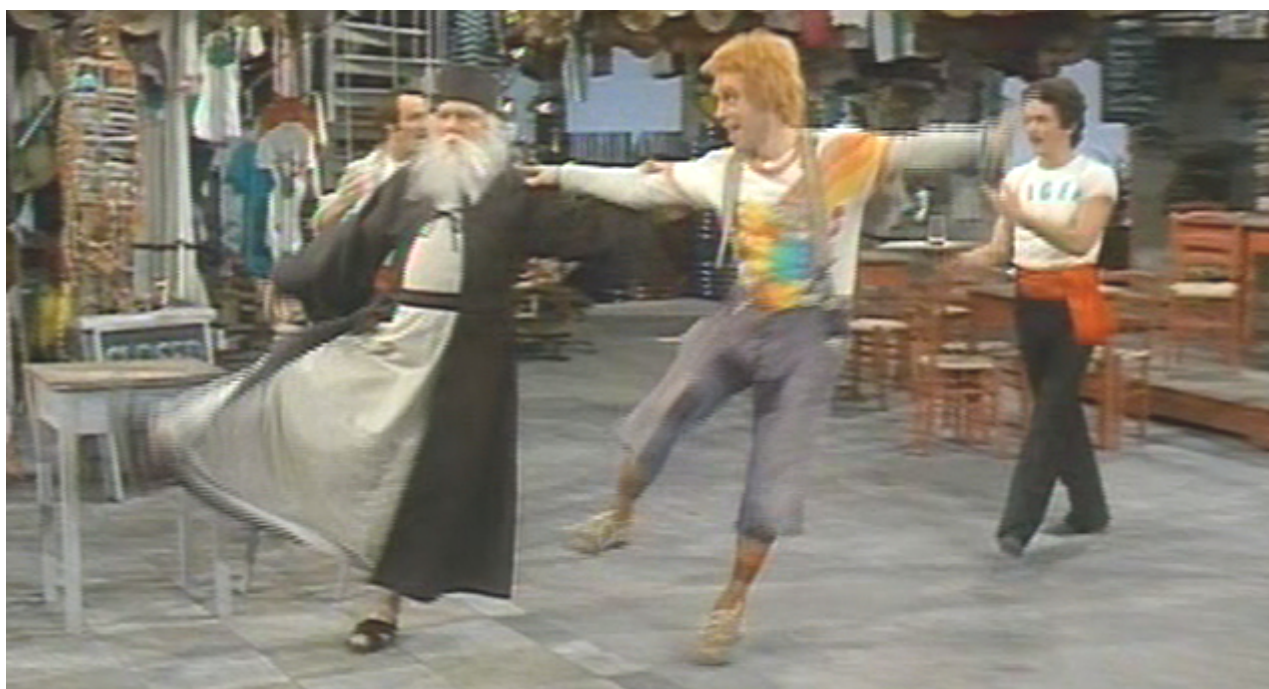
Figure 10. The sirtaki routine

pastness as distinct from ‘the past’, as completely devoid of historicity as it is replete with stereotypes. [33] It is also about Greekness, conveyed by connotation, much as, for Barthes, Marlon Brando’s fringe conveyed Roman-ness in Mankiewicz’s Julius Caesar . [34] Connotation, however, is not limited to bringing in an Orthodox pope or evzones in white stockings, garters, red shoes and black pompons. It is conveyed by way of movie intertextuality, with a sirtaki dance routine (49’15” – 52’06”; [fig. 10]) straight out of Cacoyannis’s Zorba (1964) – sirtaki being, significantly, not a pre-existing cultural artefact but a dance created for the film, with a view to imparting it with the required sense of Greekness. We are left with surfaces, a phenomenon that could not be more adequately transmitted than through, literally, film .