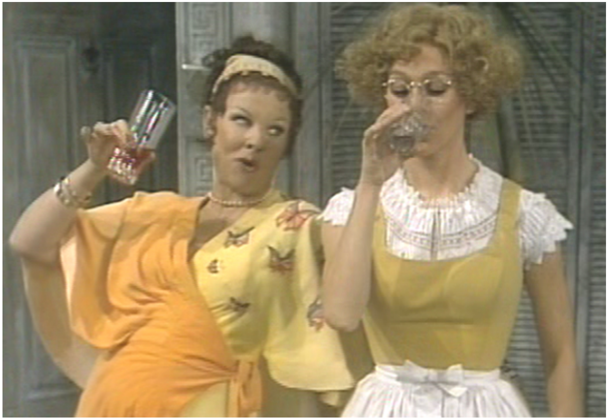
Figure 3. Act II, scene 1 Judi Dench (Adriana) and Francesca Annis (Luciana)