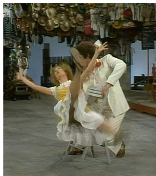
Figures 4 and 5. Left: Cyd Charisse and Gene Kelly in Stanley Donen's Singing in the Rain (1952)