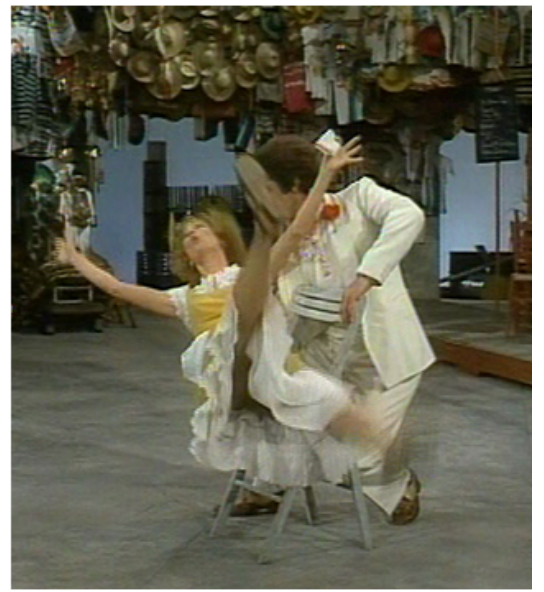
Figures 4 and 5. Left: Cyd Charisse and Gene Kelly in Stanley Donen's Singing in the Rain (1952)