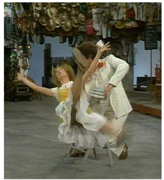
Figures 4 and 5. Left: Cyd Charisse and Gene Kelly in Stanley Donen's Singing in the Rain (1952)