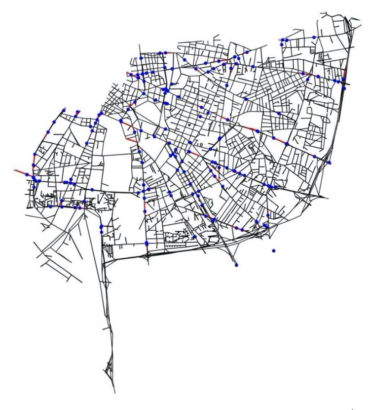
Figure 1. Lyon network of this study and location of loop detectors (Black line: all links of selected area, Red line: chosen links, i.e. network in this study, Blue dots: location of loop detectors)