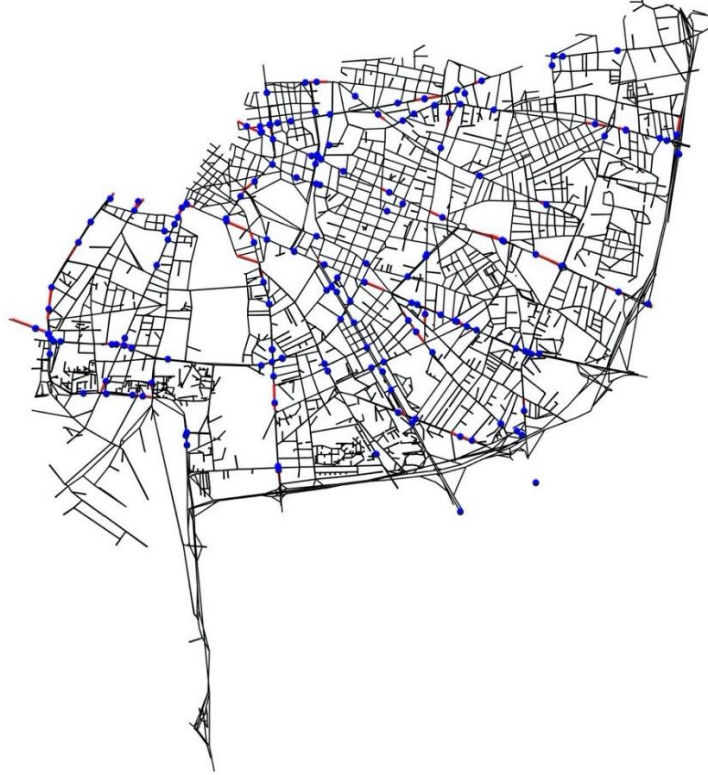
Figure1. Lyon network of this study and location of loop detectors (Black line: all links of selected area, Red line: chosen links, i.e. network in this study, Blue dots: location of loop detectors)