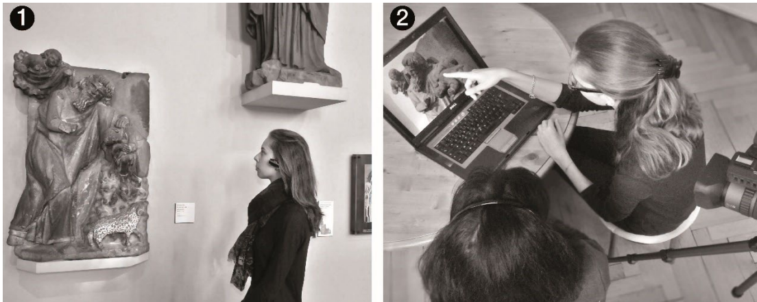
Figure 2. On the left, a person wears a side mini-camera near the ear. On the right, a person views her first-person video in order to recall and explain her actions during the visit.