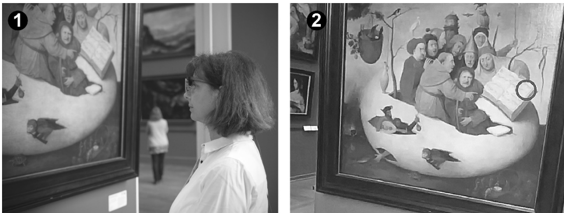
Figure 1. On the left, a visitor wears an eye tracker, on the right, a first-person video recording shows the gaze point focus, note the dark circle on the middle left of the painting.