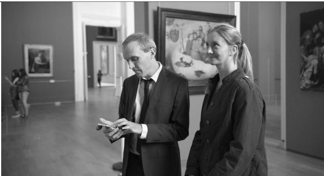
Figure 3. Visitors equipped with an E-MOTION device at the Palais de Beaux-Arts in Lille (France).