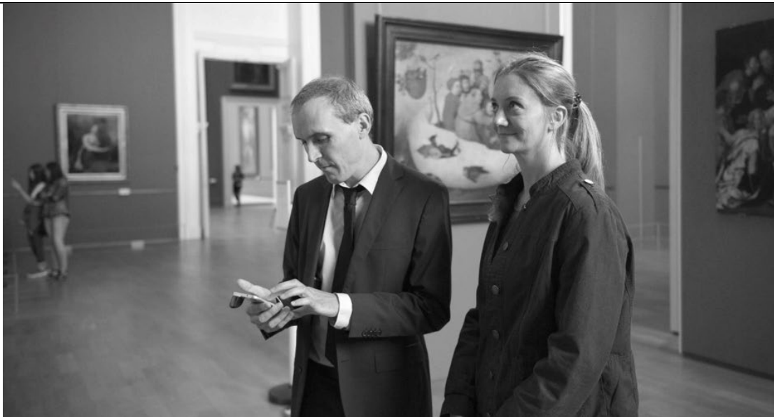
Figure 3. Visitors equipped with an E-MOTION device at the Palais de Beaux-Arts in Lille (France).