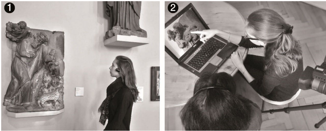
Figure 2. On the left, a person wears a side mini-camera near the ear. On the right, a person views her first-person video in order to recall and explain her actions during the visit.