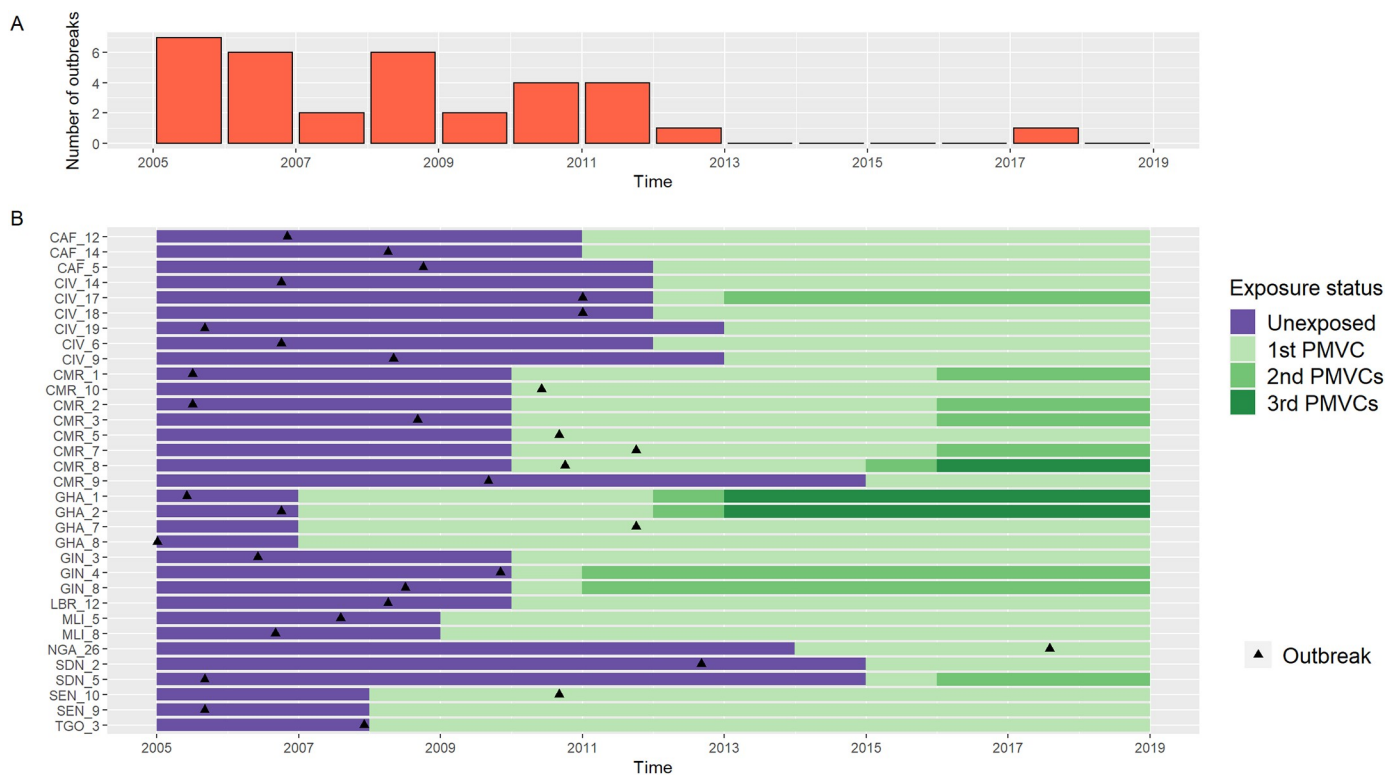
Fig 2. Swimmer plot of the chronology of exposure to preventive mass vaccination campaigns (PMVCs) and yellow fever outbreaks among the 33 African provinces both affected by an outbreak and targeted for a PMVC (2005–2018). (A) Time distribution of yellow fever outbreaks. (B) Swimmer plot. The 3-letter codes on the y-axis refer to International Organization for Standardization county codes (see S2 Table for complete province and country names).

https://doi.org/10.1371/journal.pmed.1003523.g001