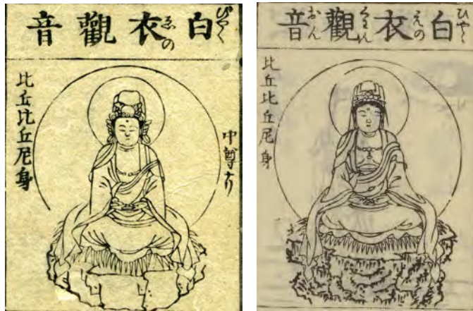
Fig. 5. Byakue-Kannon in the 1 st and 2 nd ed. of the Butsuzō-zui