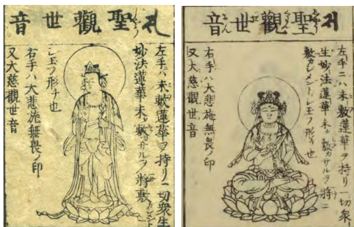
Fig. 3-4. Shō-Kanzeon in the 1 st and 2 nd ed. of the Butsuzō-zui