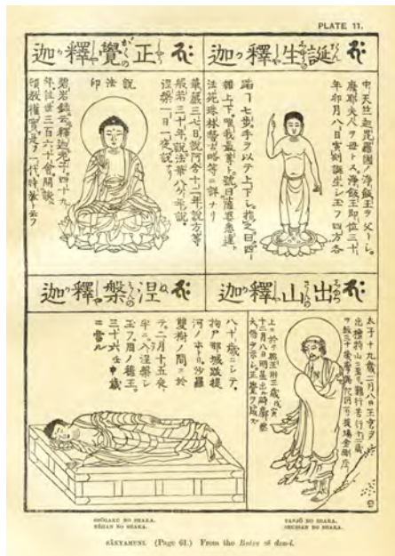
Fig. 6. Śākyamuni's life according to the 2 nd ed. of the Butsuzō-zui in Anderson's Catalogue