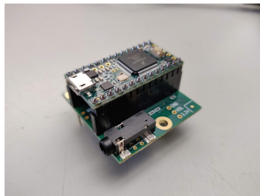
Figure 1. The Teensy 3.2 and its audio shield.

targeting specialized boards such as FPGAs (Field Programmable Gate Array) (e.g., Digilent Zybo Series 4 ) [4,5] and DSPs (Digital Signal Processing) (e.g., Analog Devices SHARC Audio Module, 5 etc.). The main drawback of these platforms is their price: fully functional “all-in-one” solutions can’t be found for less than 100USD.