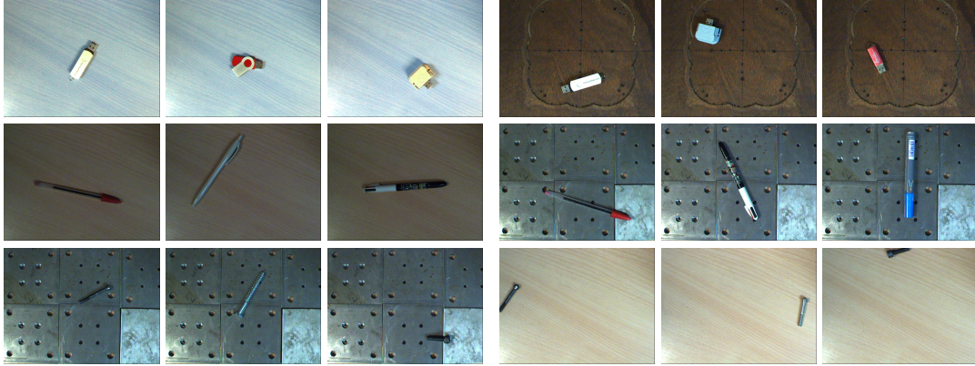
Figure 2: Example images from the robustness validation dataset. Objects in the same row are expected to be clustered in the same group. The five different background/lighting conditions are represented in this figure.

We also carry out an experiment of fine grained classification with this dataset. Within each class, we try to group together the pictures representing the exact same object. Purity results can be found in the bottom subtable of Table 5. An interesting fact can be noticed about object recognition within a category. Classes responsible for decreasing the clustering quality in the first subtable are objects with the highest purity in the second table. Such remark makes sens as low intra-cluster similarity is good for the second task but harmful for the first one.