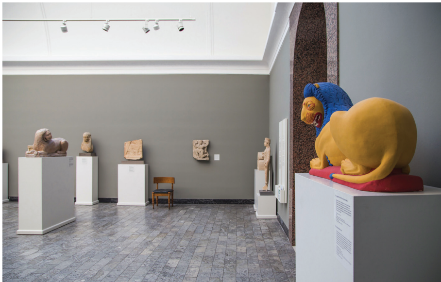
Fig. 6. Copenhagen, Ny Carlsberg Glyptotek. 2006 installation of the reconstruction of the polychromy of the archaic lion IN 1296. Reconstruction by U. Koch-Brinkmann and V. Brinkmann.