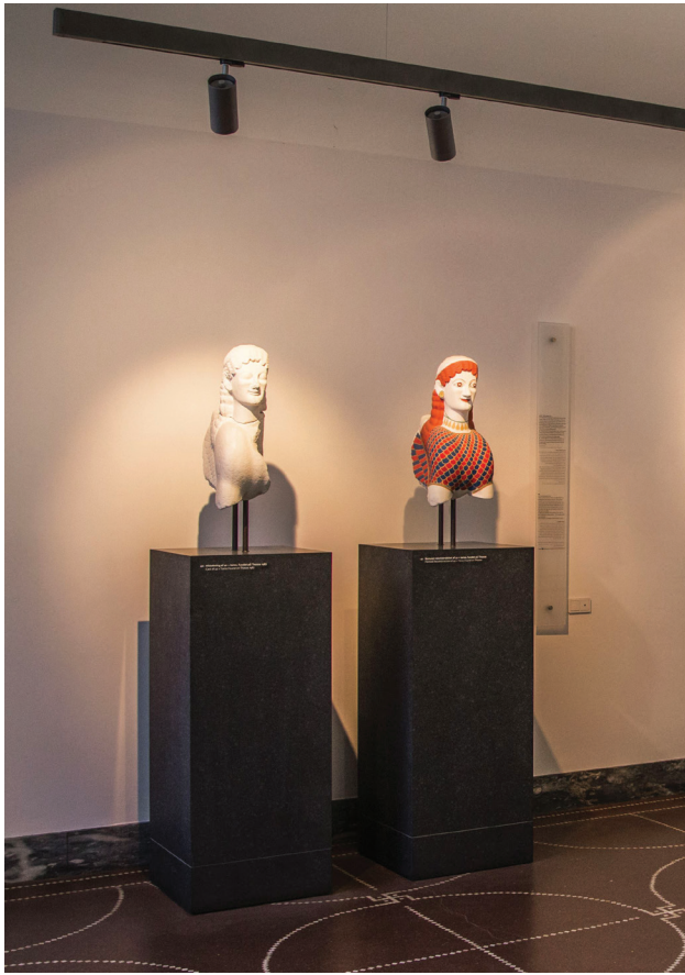
Fig. 4. Copenhagen, Ny Carlsberg Glyptotek. 2006 installation of the archaic sphinx head IN 2823 next to a cast combining the head with the torso from Thasos and a reconstruction of the polychromy of the combined cast. Reconstruction by Vinzenz Brinkmann and Ulrike Koch Brinkmann 2005.