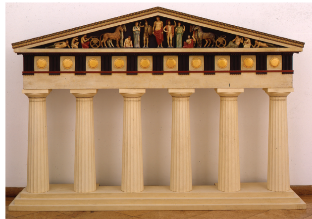
Fig. 2. Dresden, Albertinum. 1:10 scale model reconstruction of the east front of the temple of Zeus at Olympia. Painted plaster on wood. The "attempt" to show the polychromy, from 1886. Painted by Robert Diaz under the direction of Georg Treu. Dresden, Albertinum, inv. Abguss-ZV363.

from 1884: "Colours clarify and beautify the forms when seen at a distance; the plaster casts next to them appear as hard silhouettes against the background with vague inner lines" 16 . This is the first instance of the intended juxtaposition of an original in a monochrome state (albeit in plaster) and a polychrome reconstruction, accompanied by an assessment of the difference in basic visual effect.