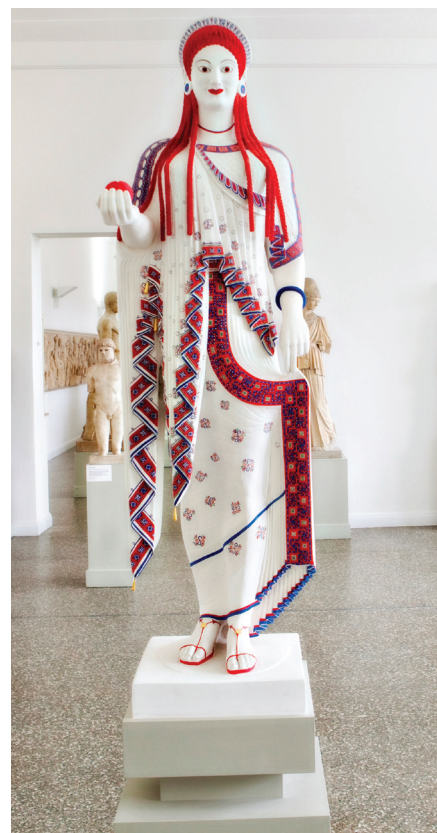
Fig. 3. Kiel, Antikensammlung. Reconstruction of Athens Acr. 682 on permanent display. Reconstruction directed by Bernhard Schmaltz.

Over several years, Bernhard Schmaltz investigated the polychromy of the Athens Acropolis Kore 682, taking as point of departure the clues provided by the earliest evidence of the preserved traces of colour. These were the water colour depictions by Guilleron and a very early cast in the Kiel collection. The results were used for a restoration of the missing parts of the statue and a reconstruction of its polychromy (fig. 3). It has since then been on permanent display, with casts of other archaic and classical sculptures in its close proximity; near the reconstruction is a detailed