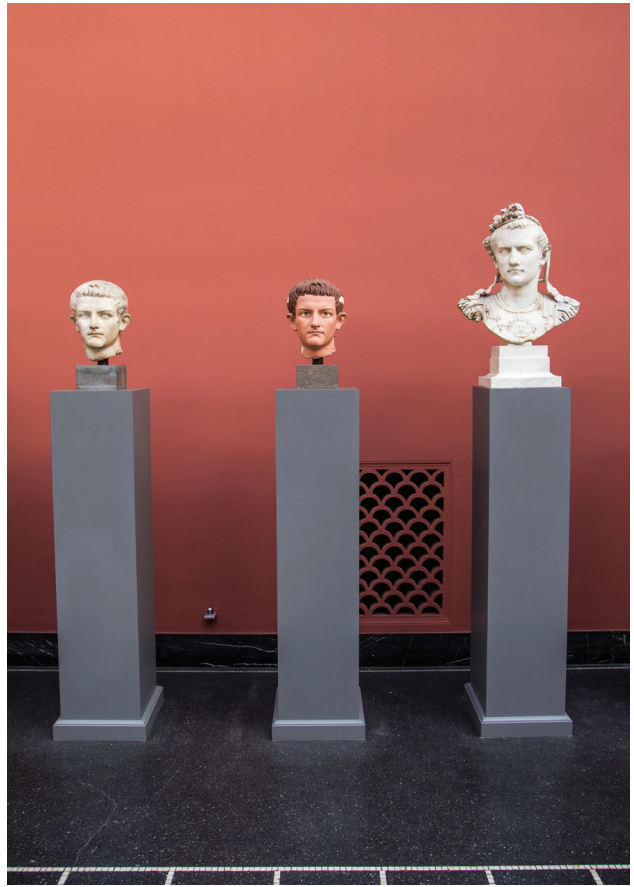
Fig. 5. Copenhagen, Ny Carlsberg Glyptotek. 2006 installation of the reconstruction on marble of the polychromy of the portrait of Caligula IN 2687. Reconstruction by U. Koch-Brinkmann, V. Brinkmann and J.S. Østergaard 2003.