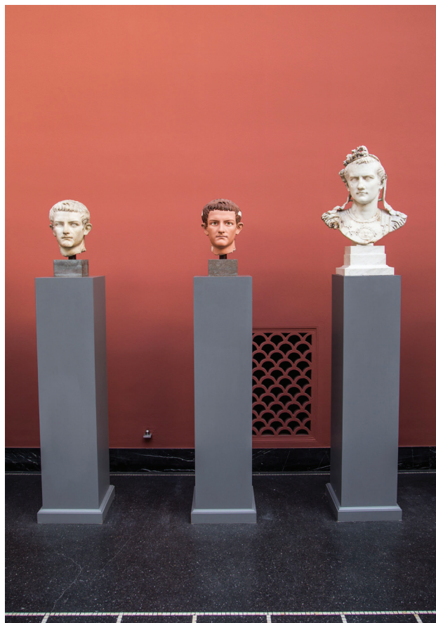
Fig. 5. Copenhagen, Ny Carlsberg Glyptotek. 2006 installation of the reconstruction on marble of the polychromy of the portrait of Caligula IN 2687. Reconstruction by U. Koch-Brinkmann, V. Brinkmann and J.S. Østergaard 2003.