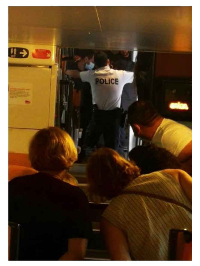
Figure 3 — In a train connecting Ventimiglia to Menton and Montecarlo, cross-border commuters watch as Police officers break open a toilet door in which illegalized migrants have been hiding. Photo © Vincenzo Condina, June 18, 2020.

The number of trains was reduced and controls at the Menton Garavan railway station, which usually focused only on "non-European looking" passengers, were generalized. Cross-border workers had to produce official documents of authorization and were advised on social networks to paste their permit to the car's side back window in order to avoid contact and speed up controls. Worker representatives also complained that controls caused traffic jams and delays. Because of this unusual situation, an international agreement was signed allowing Italian employees of Monaco companies to work from home. This actually met a long-standing demand by cross-border trade unions. As shops and markets were shut down in Italy and