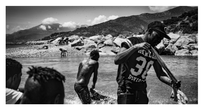
Figure 5 — In Ventimiglia, Sudanese migrants wash their clothes in the river, having arrived in Italy before the lockdown and staying in a facility until they could travel again to the French border.