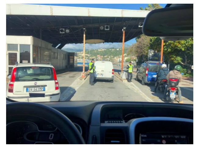
Figure 1. French authorities control all vehicles at the Pont Saint Ludovic border in three lines. April 29, 2020.

Besides this institutional facility, more spontaneous or activist solidarity towards illegalized migrants has been the object of repression and criminalization as shelters and helpdesks have regularly been dismantled (such as the No Border camp, in the summer of 2015, the St Anthony church shelter in 2016 and 2017, and the Eufemia legal helpdesk in 2017-2018) and more than sixty activists have been banned from the territory of Ventimiglia since 2015. Immediately before the COVID-19 measures, three solidarity points remained operational: a solidarity café near the Ventimiglia railway station, the local Caritas humanitarian association, and a permanent presence of activists monitoring the pushbacks in the vicinity of the border police station.