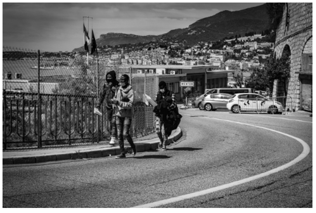
Figure 4 — At the French border checkpoint in Menton, three pushed-back migrants start the 10-kilometre walk back to Ventimiglia.