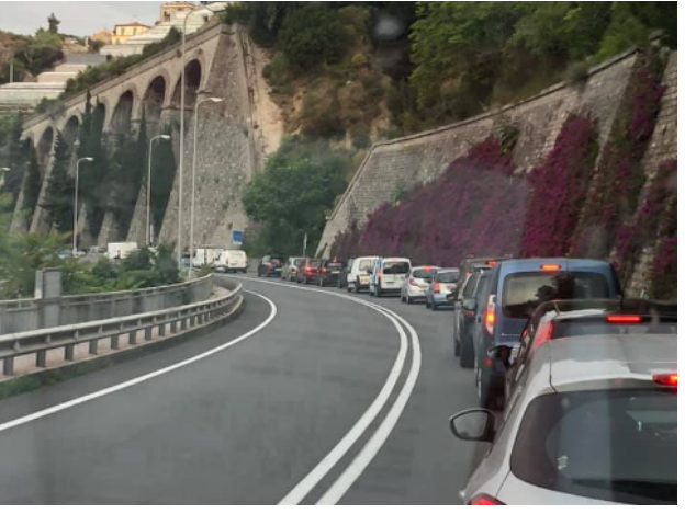
Figure 2. Cross-border commuters in a traffic jam caused by COVID-19 border controls. Photo © Vincenzo Condina, June 2, 2020.