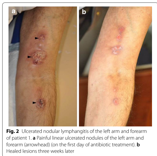
Fig. 2 Ulcerated nodular lymphangitis of the left arm and forearm of patient 1. a Painful linear ulcerated nodules of the left arm and forearm (arrowhead) (on the first day of antibiotic treatment). b Healed lesions three weeks later

moat sediment and from sludge obtained from a sewage treatment plant. To date, only nine clinical isolates of N. takedensis have been reported in human [2–7, 13–15]. The main clinical and microbiological features of N. takedensis isolates are summarized in the Table 1. Including the two patients of our study, the mean patients’ age was 64 years (33–87 years), with a sex ratio of 1.25. N. takedensis is mostly involved in primary cutaneous Nocardiosis, just as the closely related species N. brasiliensis is [16, 17]. Indeed, seven out of eight infected patients (88%) presented various forms of skin and soft tissue infections such as cellulitis, chronic skin ulceration, lymphangitis, or mycetoma, that occurred several days after a skin lesion allowing bacterial inoculation [3–7, 15, our study]. In one patient N. takedensis was isolated from a respiratory specimen but without any clinical or radiological signs of pulmonary Nocardiosis, therefore corresponding to a transient pulmonary colonization [13]. For the last three clinical isolates reported in the literature, no clear and substantial data referring to the clinical cases were available [2, 14, 15].