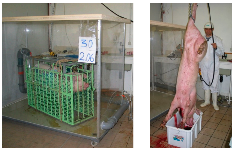
Figure 1. Experimental set-up: the gas chamber containing a pig (left) and the blood collection of the slaughtered pig (right).

The lid made from extruded polystyrene consisted of two halves to allow rapid closing and opening of the chamber. Grooves in the lid, both at the level where the lid joined the Perspex glass and where the two halves joined, allowed a relatively airtight closing of the chamber. Each half lid was equipped with a half PVC tube, vertically positioned, that joined each other in the middle to serve as a guide for the chain of the pulley that carried the cage with the pig. This tube was closed airtight between tests if the box contained gas. At a distance of 30 cm above the floor of the chamber, 10 cm from an angle, two connecting sleeves were permanently fitted on, to which gas tubes were attached to fill the chamber with gas. A closed circuit made from 10 cm PVC tubes and equipped with a ventilator (Systemair, Skinnskatteberg, Sweden) turning at a slow speed was fitted externally to the chamber to ensure homogeneous gas mixtures. It drew the gas mixture from the chamber in a corner 15 cm above the floor and returned it to the chamber in the diagonally opposite corner, at 97 cm above the floor. A sensor connected to a CO 2 /O 2 analyser (Oxybaby gas analyser, Witt, Morsang sur Orge, France) was attached to the tube, at the level of the opening which the gas mixture was returned. The room was further equipped with manual stunning tongs, a slaughterline and a cold chamber kept at 4 °C.