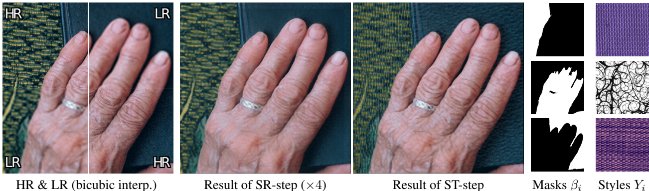
Fig. 1: The proposed method performs super-resolution (SR) in two steps. The low resolution (LR) input x (here, the test image 0787 from the DIV2K dataset [1], upsampled with bicubic interpolation) is first processed with a shallow multi-scale convolutional network (SR-Step). Within the same network, the resulting image can then be locally stylized (ST-step, here with user-defined “Masks”) to add lost details, such as textures or grain, from pretrained “Styles”. Masks are defined using GMIC [2] “interactive extract foreground”. More examples can be found at [3].

Normandie Univ, UNICAEN, ENSICAEN, CNRS, GREYC, 14000 Caen, France {Thibault.Durand, Julien.Rabin, David.Tschumperle}@unicaen.fr