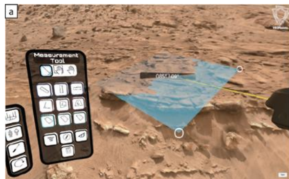
Fig. 3: Use of dedicated VR geological measurement tools on the Kimberley area.

Stand-alone applications: We are also investigating how the information from various sources can be integrated into a single comprehensive way to display, manipulate, analyze and share both analytical data and results. The use of a more powerful and versatile solution based on a game engine [7] allows the development of such more complex solutions. An application has been developed to recreate common geological measurements tools in VR on the Kimberley area in Gale crater (Mars), allowing the detailed quantitative investigation of a layered outcrop of sedimentary origin (Fig. 3, see also [8]).