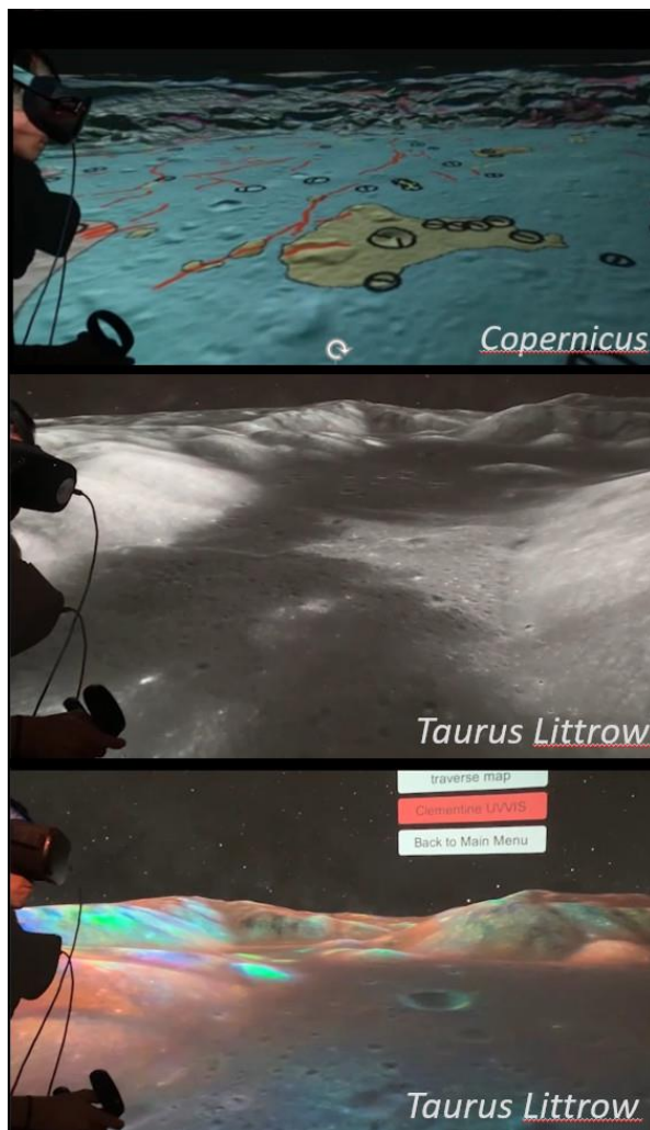
Fig. 4: The integration of orthoimages draped on a digital elevation model into a VR environment allows the user to freely explore and observe the structures from any point of view, without the deformations induced by reprojections on a traditional computer screen.

In terms of hardware solutions, when high levels of details and significant data volumes are required, the VR headset has to be coupled to a high-end computer embarking a gaming-rated GPU to process the virtual environment. In the case of more optimized or focused application, a wireless headset such as the Oculus Quest might be powerful-enough to provide a comprehensive experience.