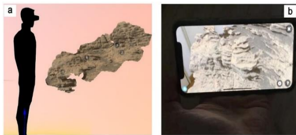
Fig. 1: Use of the Sketchfab online platform to visualize digital outcrop models derived from Curiosity imaging data using a Virtual Reality headset (left), or using Augmented Reality with a smartphone (right).

Online Resources: The VR and/or AR rendering of simple orbital and/or ground-based 3D models can be first performed using a web-based solution such as Sketchfab. This offers the possibility to easily visualize, interact, and share medium-resolution 3D models derived either from photogrammetric or stereoscopic reconstructions (e.g. https://sketchfab.com/LPG-3D or https://sketchfab.com/planmap.eu , Fig. 1 and 2).