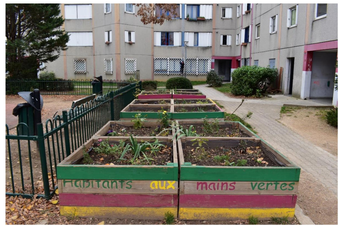
Street gardens in Saulaie (Oullins)