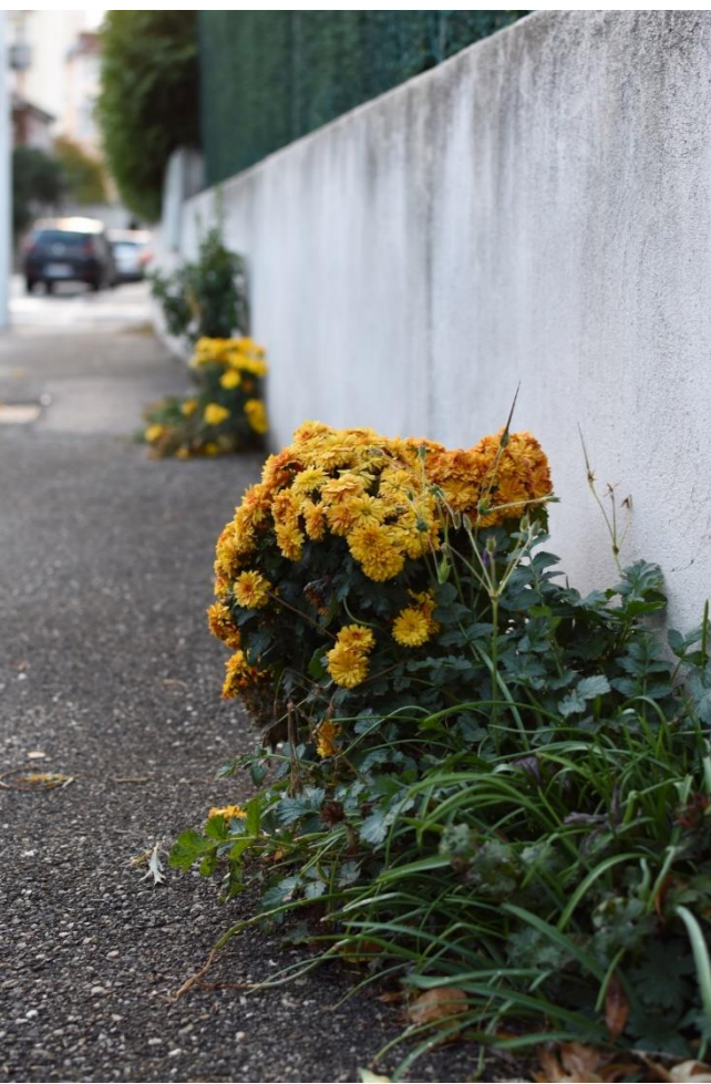
Street garden Montchat