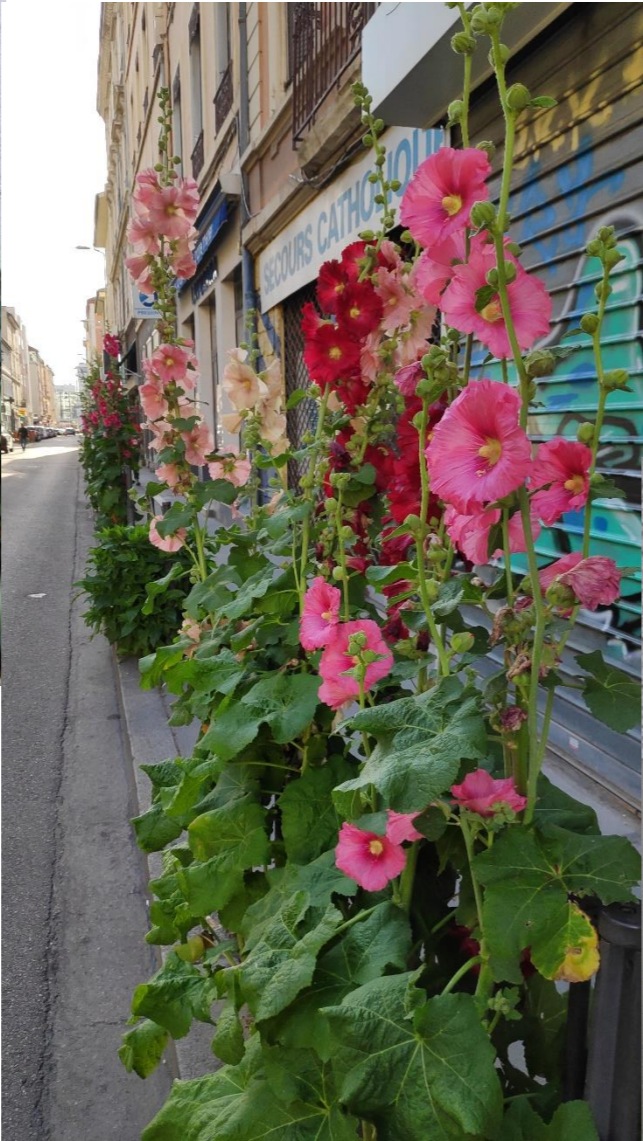
Street garden Paul Bert