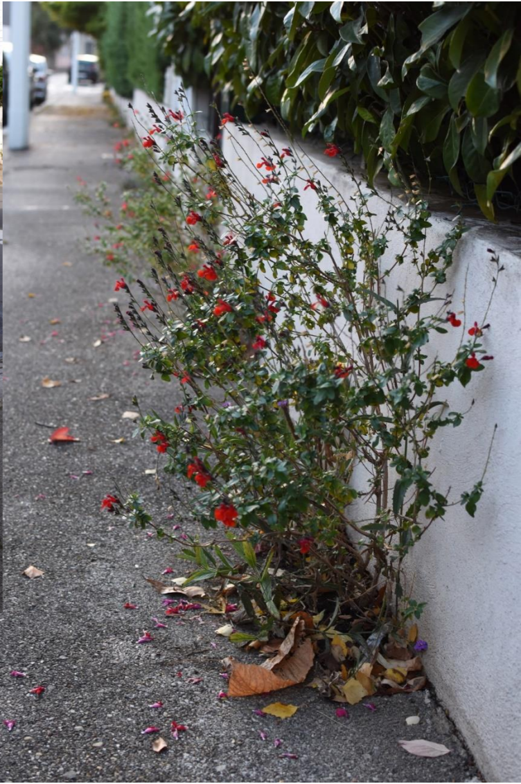
Street garden Montplaisir