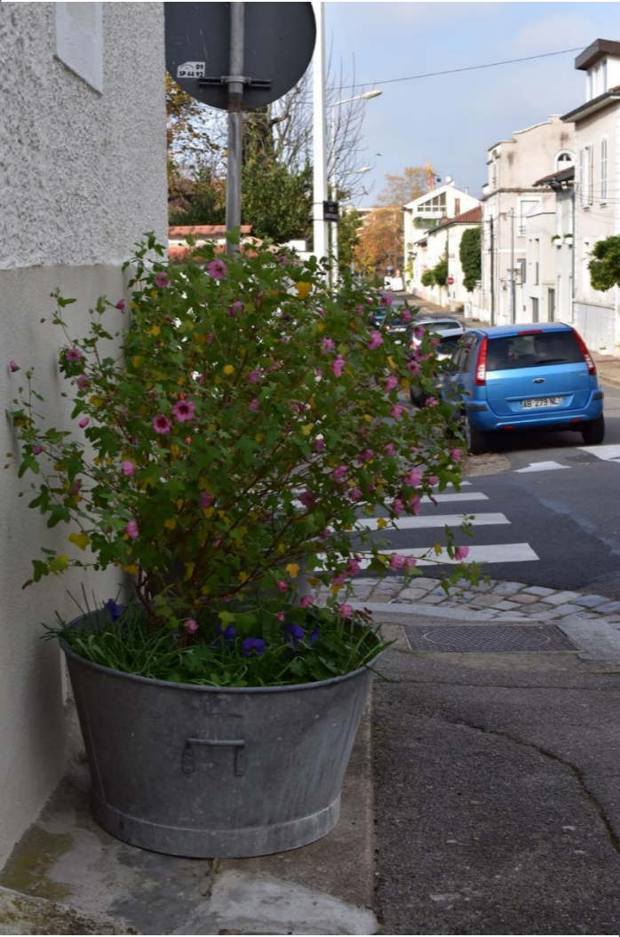
Street garden Montchat