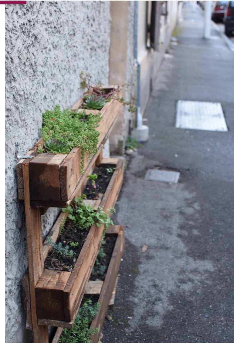
Jardinières de rue, 3ème